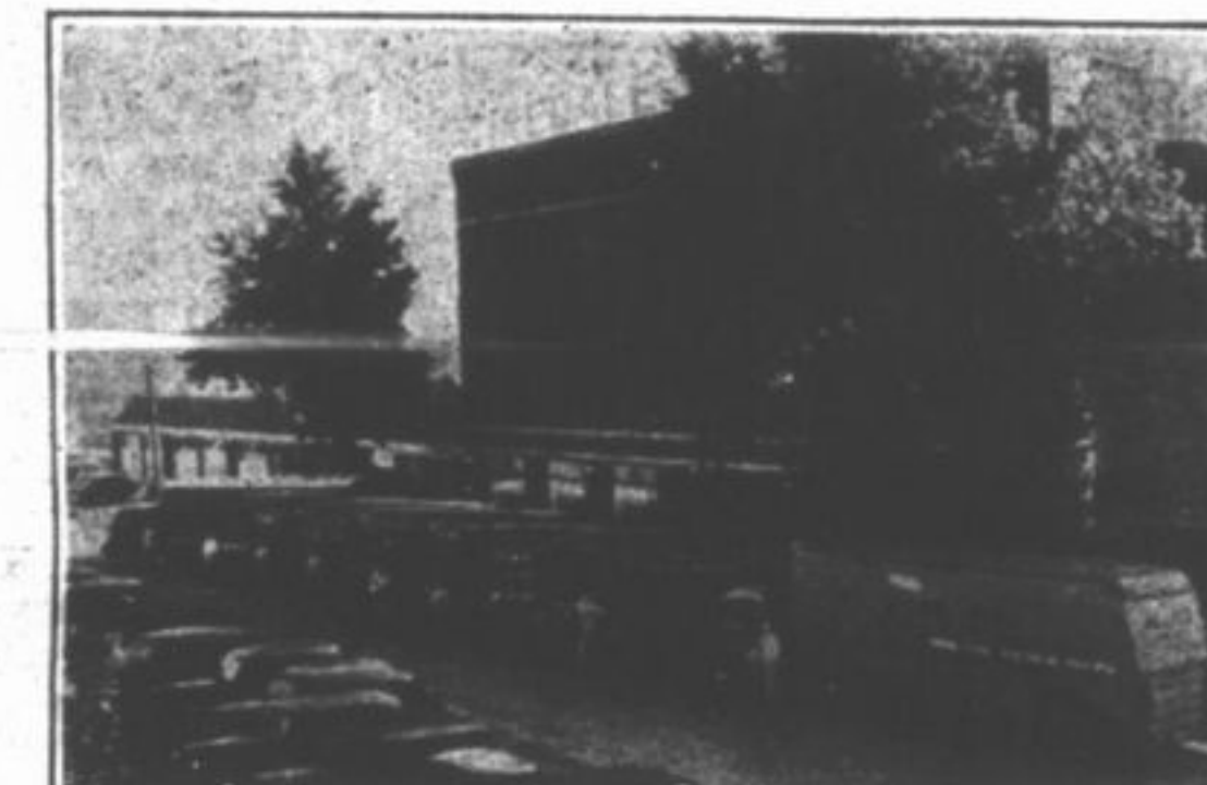
1938 "Streamlined Motor Vans" The Iredale Organization carries on... progressing and growing according to the tradition of its founder.