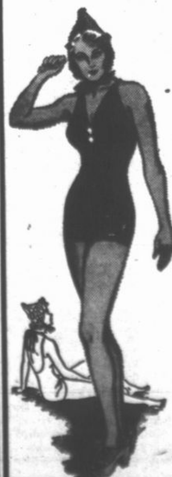
The Vee Tuck Illustrated at left

If you dote on trim brevity, you'll dote on the Jantzen Clipper! Briefly cut for glorious free action and perfect comfort. Wonderfully soft, feathery light, comfortable girdle-fit—because it's made of Wisp-O-Weight, Jantzen's quick drying fabric triumph of wool and "Lastex" yarns. $5.95.