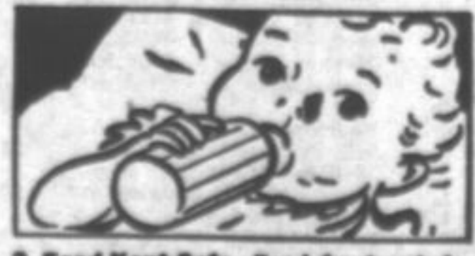
3. Food kept Safe—Food for the whole family kept at just the right temperature within the safety zone.

New up-to-the-minute features save time and work in the kitchen!