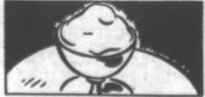
2. Delicious Frozen Desserts—How many exciting dishes you can prepare—and how easy they are to freeze, now!