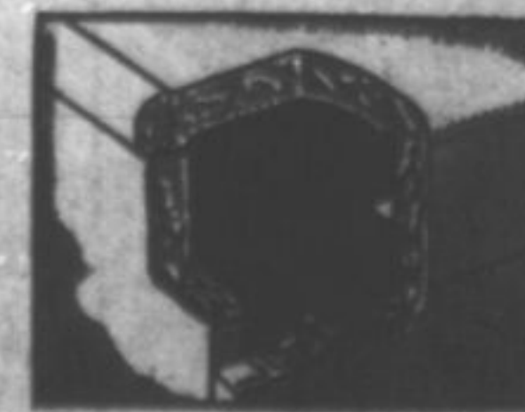
Thick oven insulation of heavy rock wool keeps all the heat in the oven where it belongs.