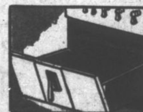
Convenient broiler prepares meats and other foods the correct way... under a flame.

Smart homemakers on the North Shore continue to show their enthusiasm for GAS RANGES to the tune of nearly 100 gas ranges to 1 range using other fuel. Such continued confidence proves that GAS is, after all, the logical home fuel! GAS is cooler, quicker, cheaper!