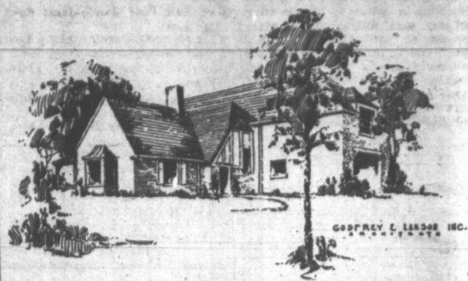
GODFREY E. LARSON INC.