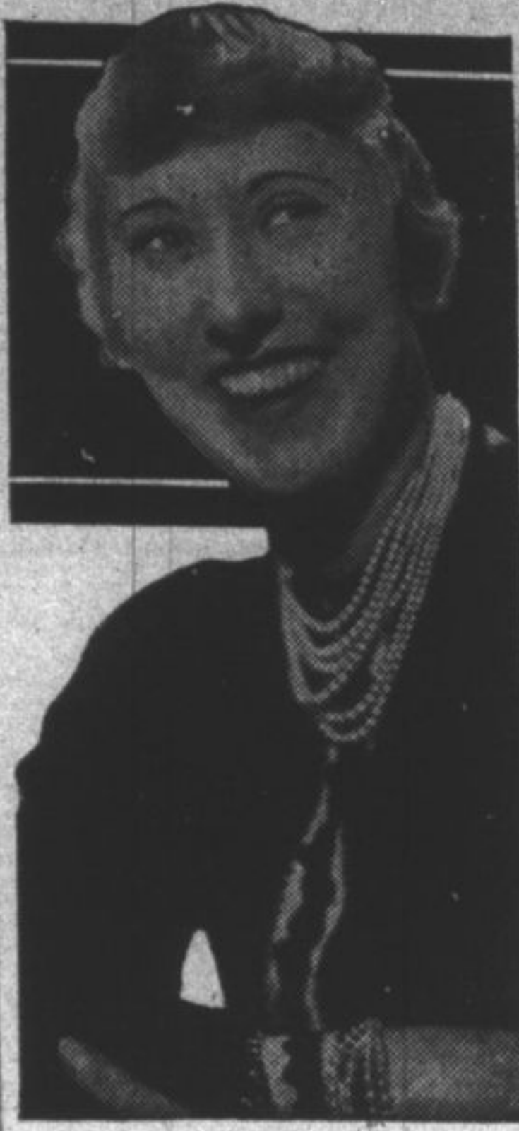
Now appearing in "Leaning on Letty" at the Selwyn Theater, Chicago.