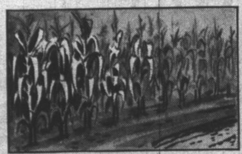
RAISED ON AMERICAN-GROWN GRAINS BY AMERICAN FARMERS