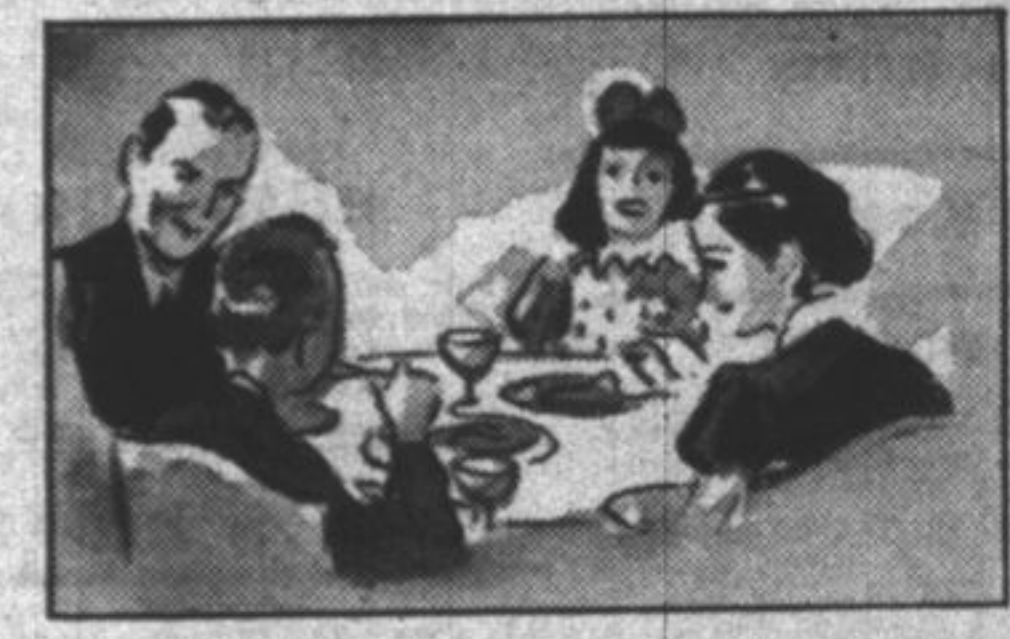
FOR LOYAL "AMERICAN" FAMILIES