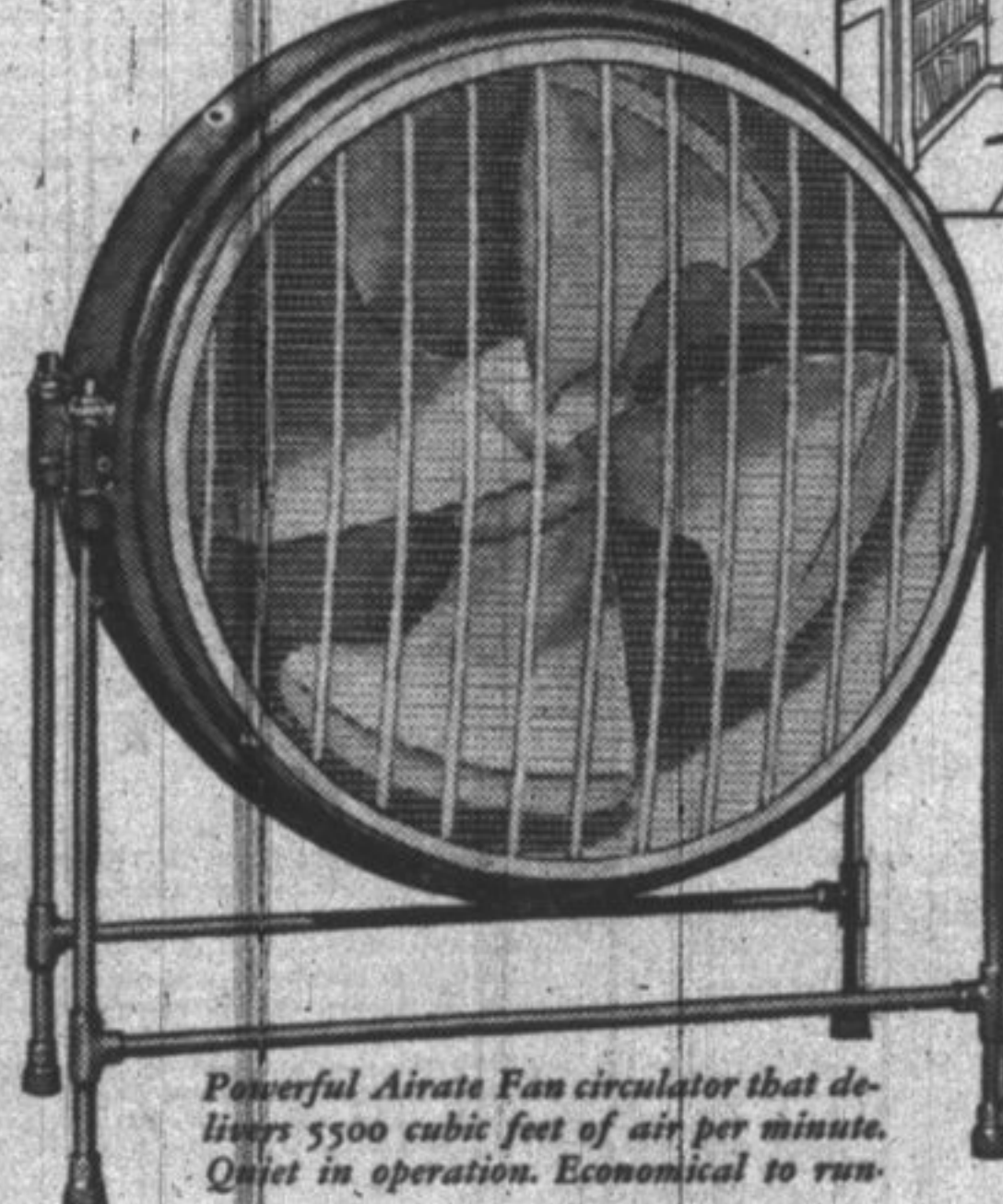
Powerful Airate Fan circulator that delivers 5500 cubic feet of air per minute. Quiet in operation. Economical to run.