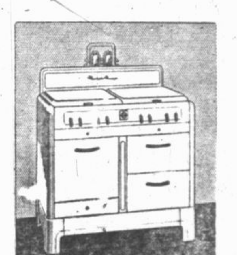
Universal Gas Range An elevated, In-A-Drawer, odorless broiler and six top burners are features of the "Manchester" Universal gas range (above).