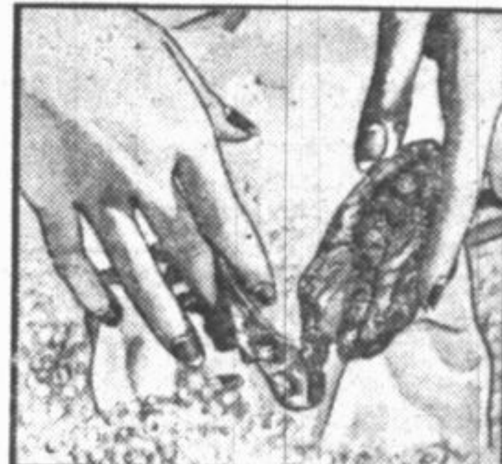
The Thor "gentle hand" thoroughly washes all your laundry as gently as you would wash it by hand.

PUBLIC SERVICE COMPANY OF NORTHERN ILLINOIS