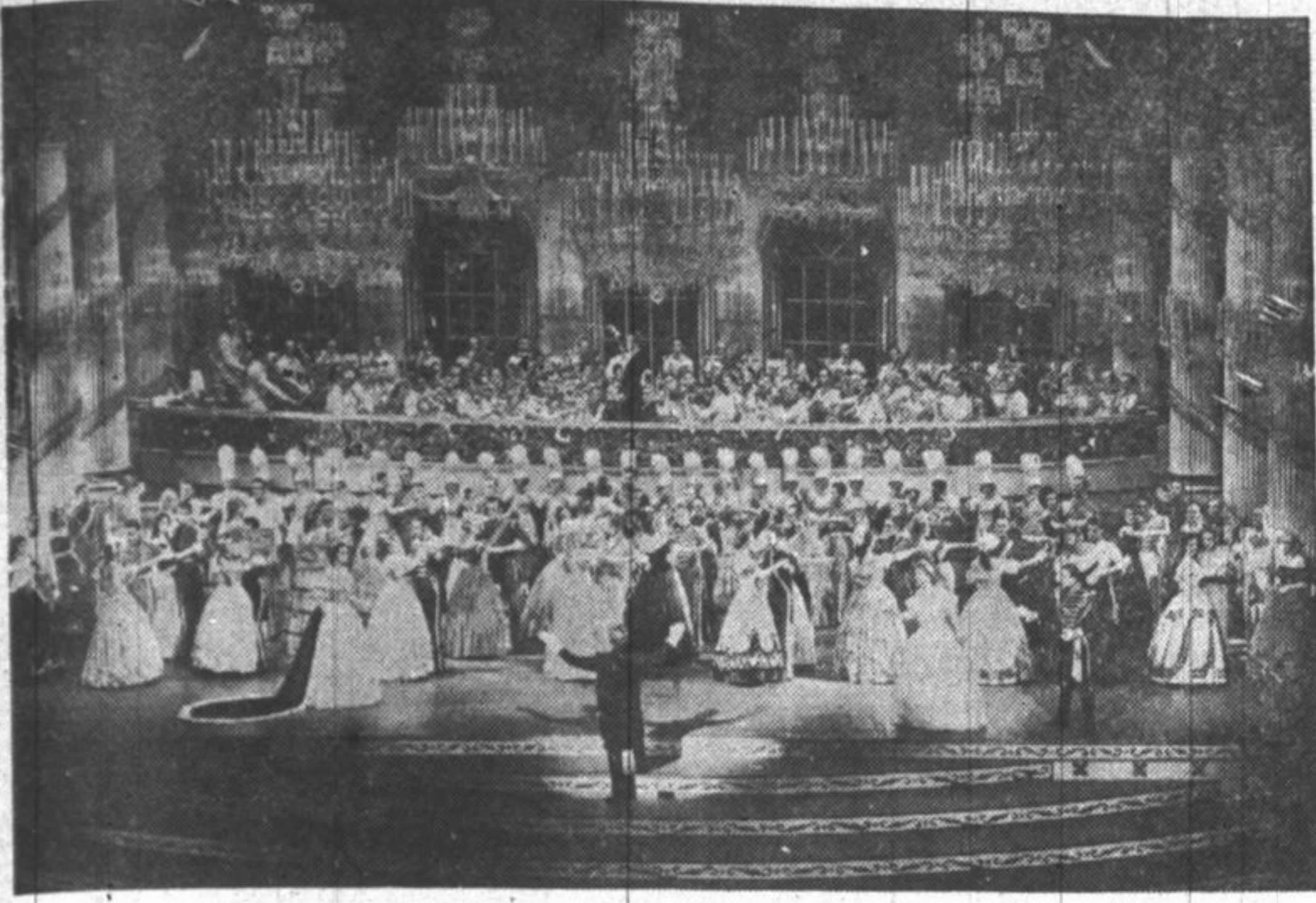
Young Johann Strauss conducts his father's orchestra, in his own new waltz—"The Beautiful Blue Danube."

While the gorgeous scenic effects in "The Great Waltz," Max Gordon's spectacular four star musical play that has scored an emphatic hit at the Auditorium Theatre, Chicago, are decidedly important to its success, they are by no means the sole reason for the enormous favor of this huge production from Radio City, New York.