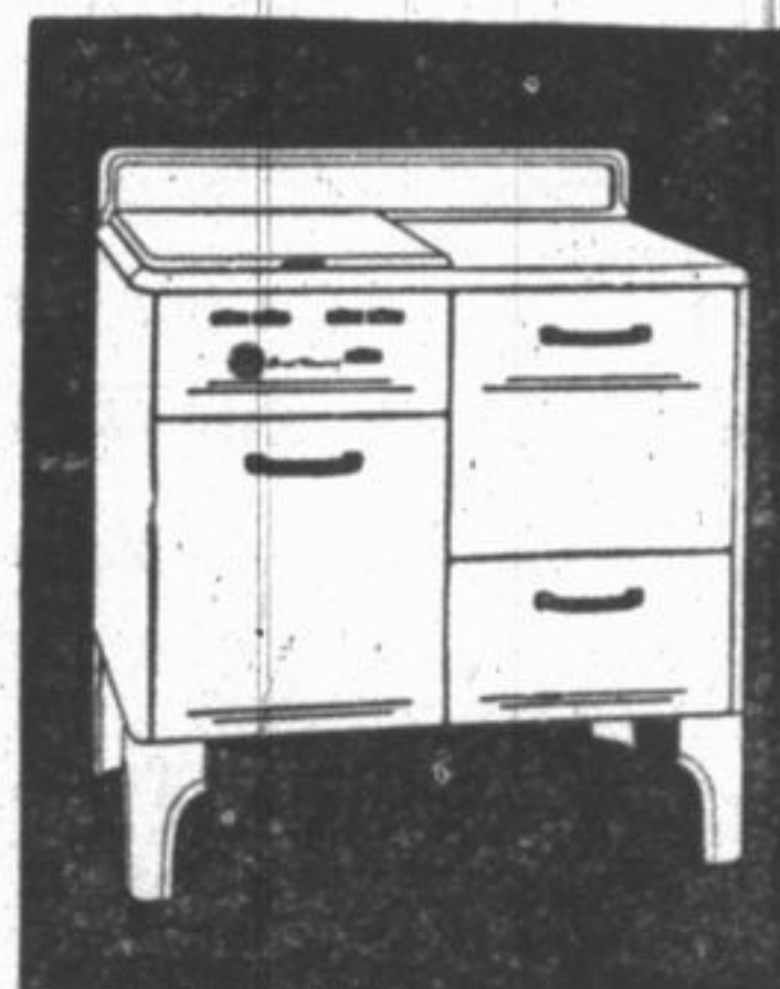
Universal Gas Range

This unusually convenient plan brings you the countless advantages of a modern gas range... Electrolux gas refrigerator... and automatic gas water heater. Don't delay! Terms are as low as 17c a day. You can own an efficient modern kitchen with little change in your household budget. Get full details now! Come in and see our display. Or telephone.