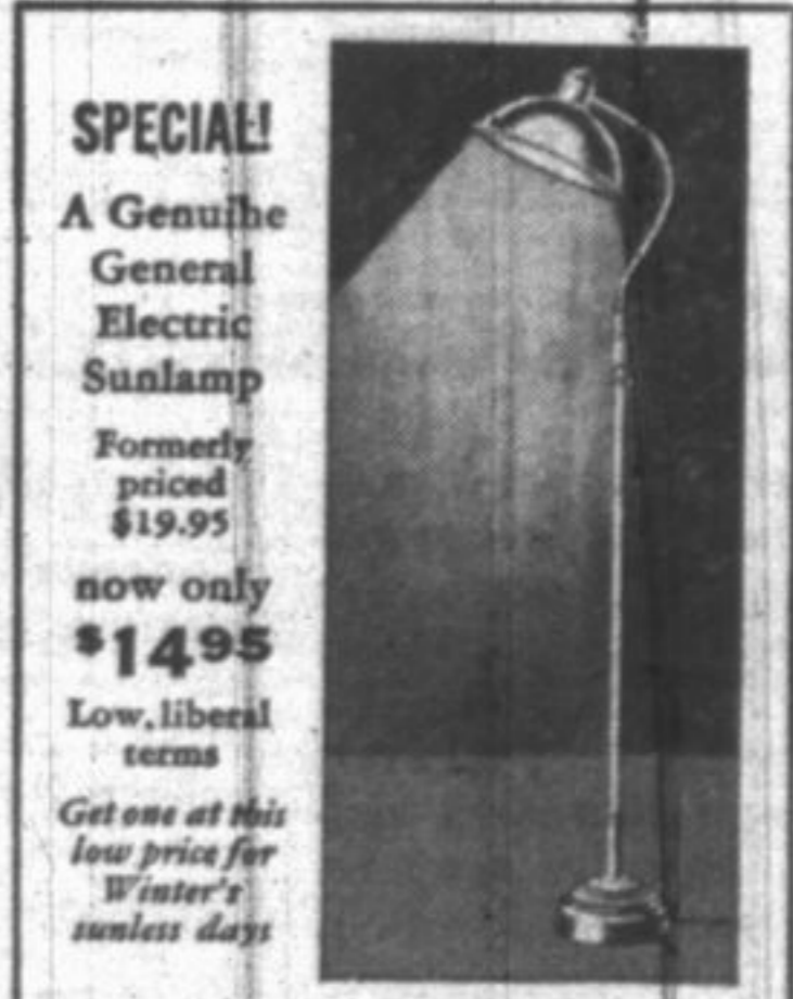
SPECIAL! A Genuine General Electric Sunlamp Formerly priced $19.95 now only $14.95 Low, liberal terms Get one at this low price for Winter's sunless days

Bull's Eyes of TRUTH By PLAIN-SPOKEN PETE EVERY MAN WHO WORKS FOR A LIVING IS ENTITLED TO RESPECTFUL CONSIDERATION UNLESS THE BROTHERHOOD OF MAN'S IDEA IS JUST ELECTION DAY APPLE SAUCE