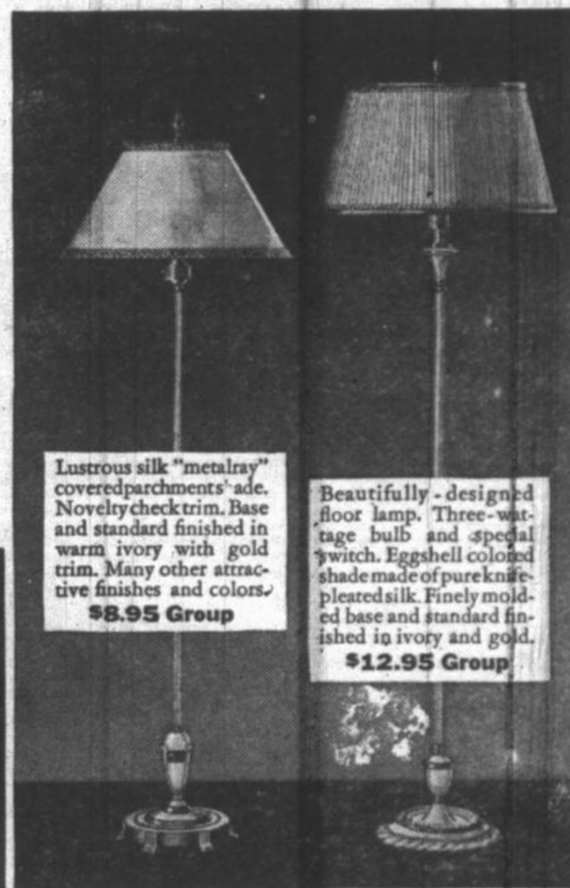
Lustrous silk "metalray" covered parchment's shade. Novelty check trim. Base and standard finished in warm ivory with gold trim. Many other attractive finishes and colors. $8.95 Group