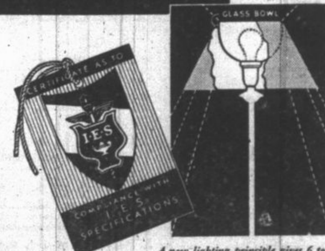
The Illuminating Engineering Society tag on lamps, assures you that the lamp complies with 55 strict requirements for mechanical, safety and illuminating excellence.

See the "New American" Model Homes in Oak Park, Downers Grove, Wheaton, and in Chicago at Beverly Hills and Sauganash.