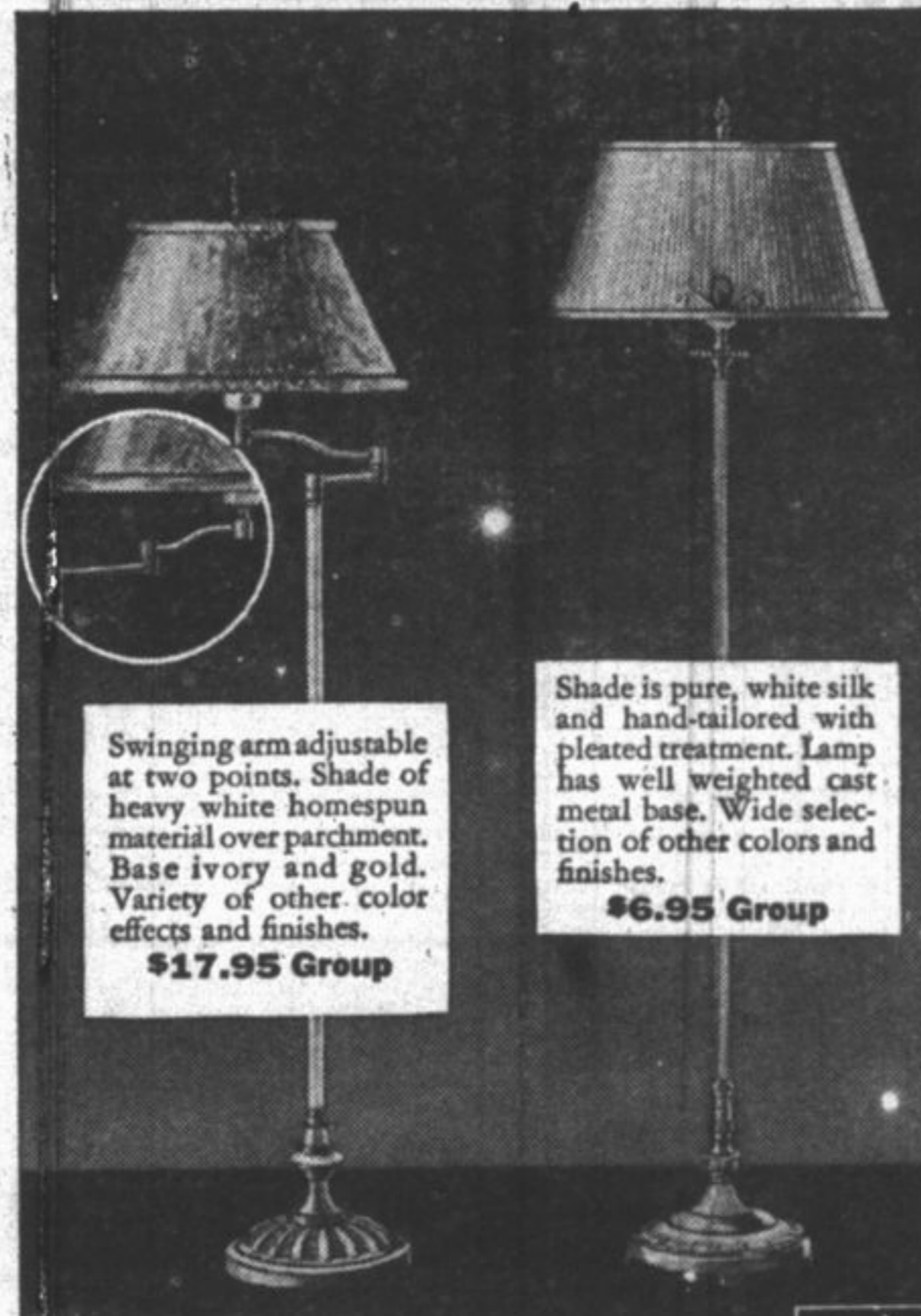
Swinging arm adjustable at two points. Shade of heavy white homespun material over parchment. Base ivory and gold. Variety of other color effects and finishes. $17.95 Group