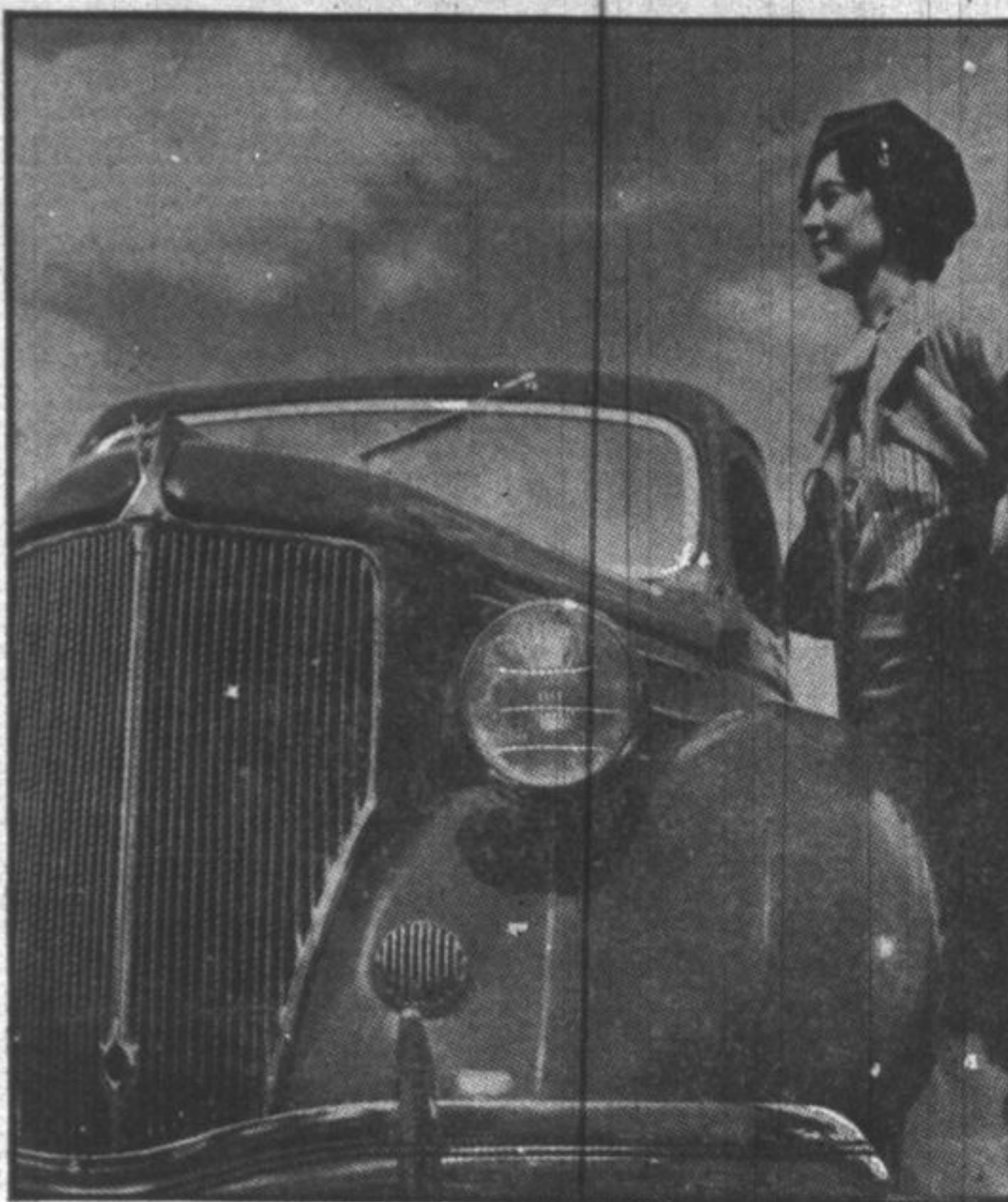
THE IMPROVED streamlining of the front end of the Ford V-8 for 1936 is well illustrated by this camera shot. Note the horn set into the fender apron behind a chromium grille and the way the graceful contour of the fender is carried to the edge of the new radiator grille. A glimpse of the new hood louvers is caught behind the headlamp. The V-8 insignia on the prow of the car is of new design.

The Bethlehem church Woman's Auxiliary is meeting Thursday afternoon (today).