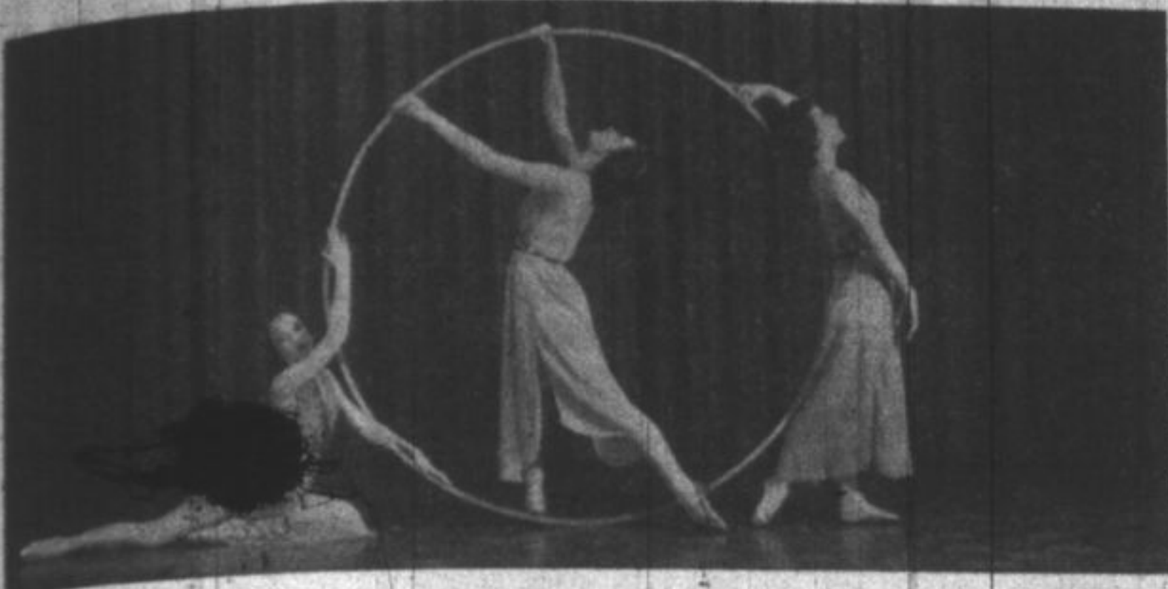
From "Golden Hoop Dance" by pupils of school