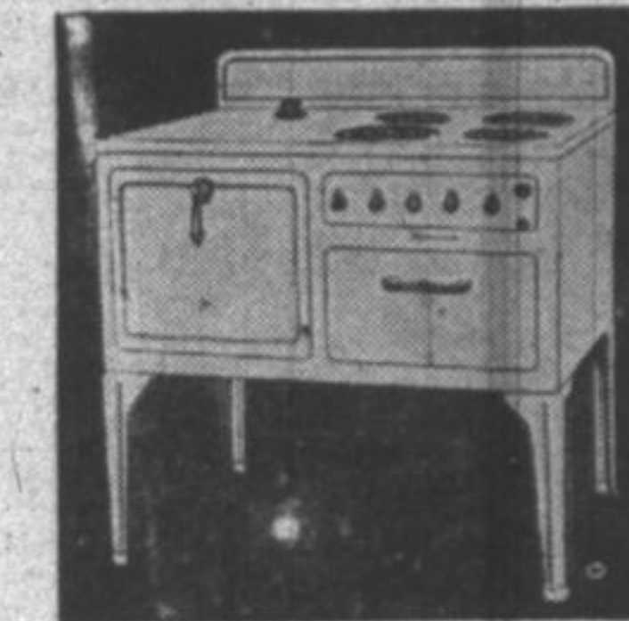
Westinghouse MODEL A-64

Low rates, small payments, and cooking economics make it possible for you to have