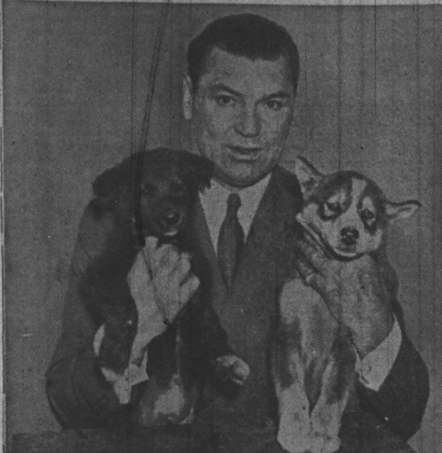
But this time the punch is not the kind you pack in a glove or serve out of a bowl. It's a malamute pup. Reading from left to right, Punch, Jack Dempsey and Judy. Punch and Judy come from Little America. They were brought here and presented to Dempsey by Commander Byrd. Dempsey has the pups quartered on the roof of his famous restaurant in New York City, opposite Madison Square Garden.