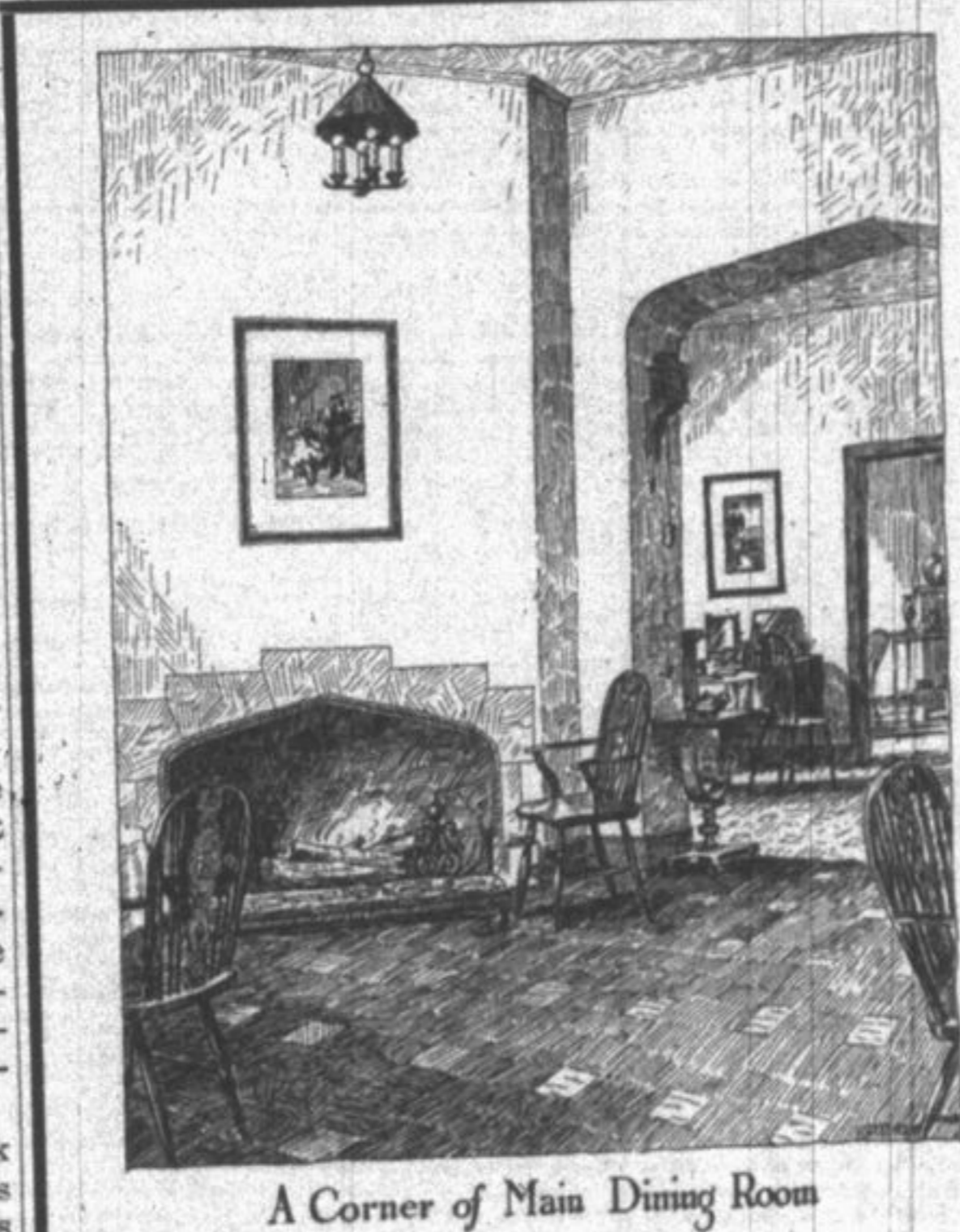
A Corner of Main Dining Room