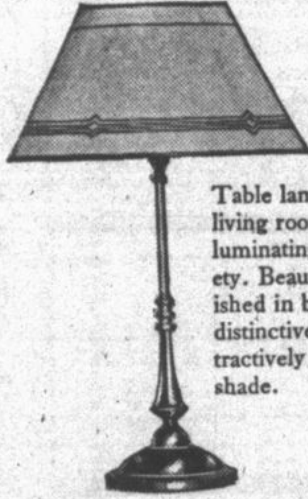
Table lamp for study room or living room. Approved by Illuminating Engineering Society. Beautiful metal base finished in bronze and gold with distinctive tapered shaft. Attractively designed parchment shade. Price only $6.75

A FEW OF THE LAMPS NOW ON DISPLAY Designed for Better Seeing