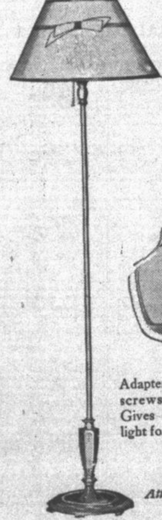
Adapter kitchen lighting unit, screws in ordinary socket. Gives comfortable, glareless light for kitchen work. Price only $1.40

Attractive eye-saving lamps are also being shown by other dealers