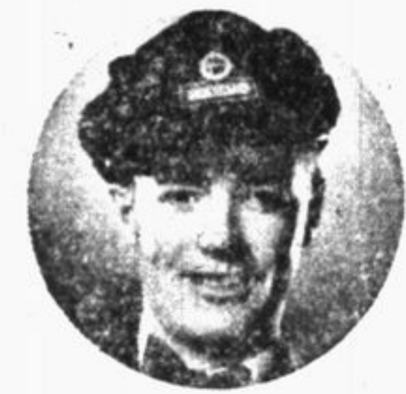
A courteous attendant always greets you at the Red Crown pump

All are genuine Standard Oil products and that is your assurance of VALUE