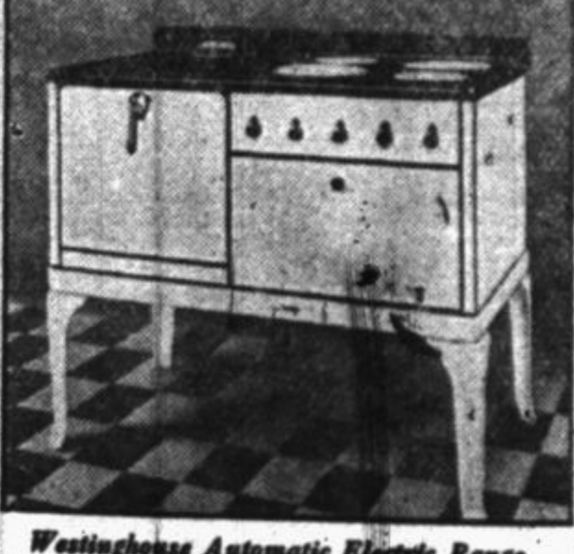
Westinghouse Automatic Electric Range