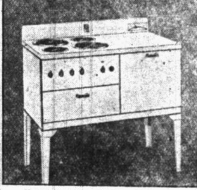
Hotpoint Automatic Electric Range