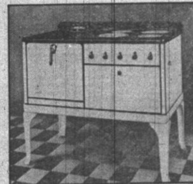
Westinghouse Automatic Electric Range

HOT WATER, too SPECIAL COMBINATION OFFER