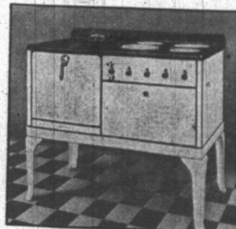
Westinghouse Automatic Electric Range

HOT WATER, too SPECIAL COMBINATION OFFER