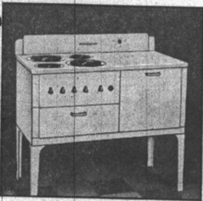
General Electric Automatic Electric Range