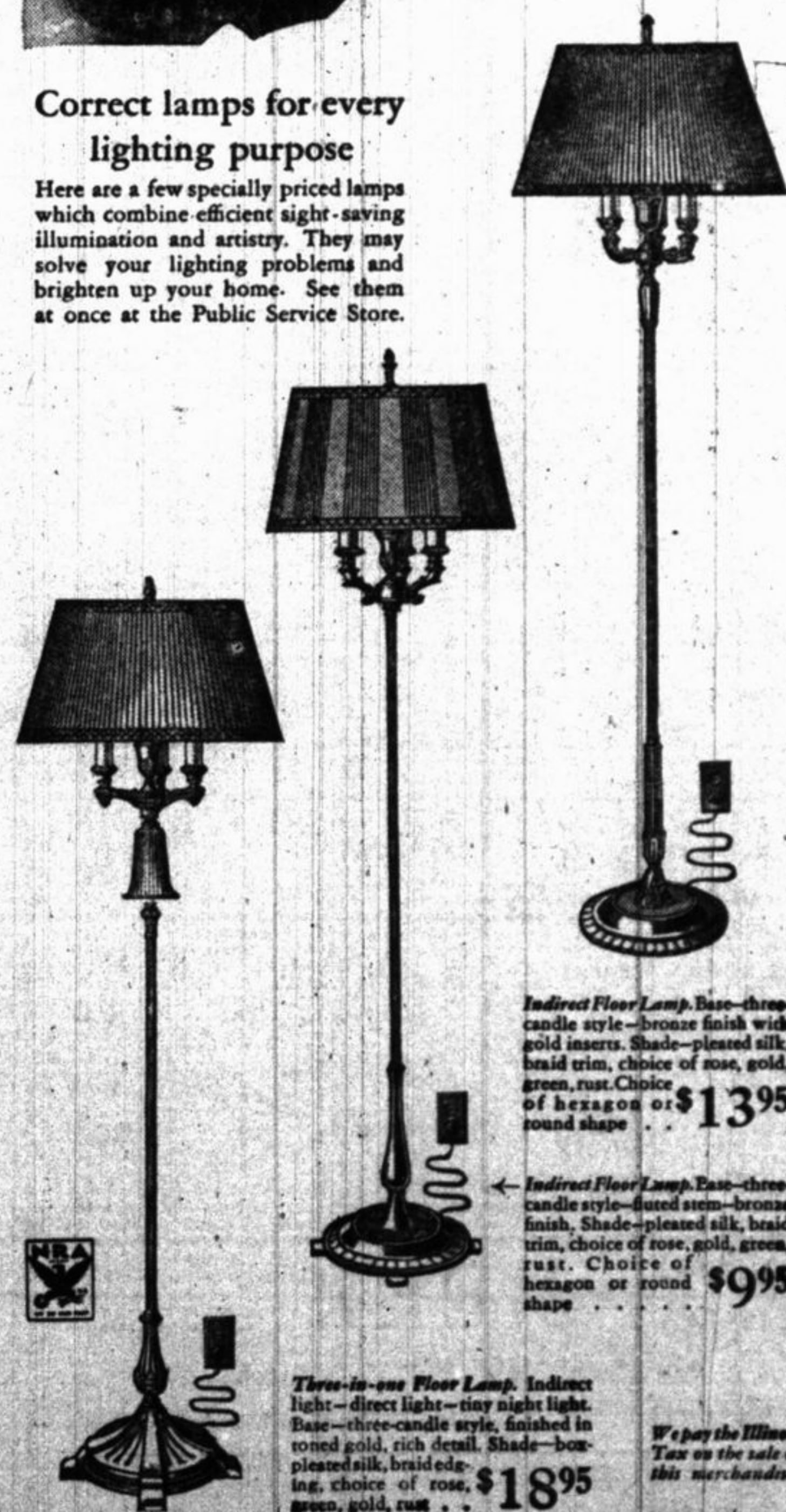
Indirect Floor Lamp. Base—three-candle style—brass finish with gold inserts. Shade—pleated silk, hand trim, choice of rose, gold, green, rust. Choice of hexagon or round shape... $13.95

Here are a few specially priced lamps which combine efficient light-saving illumination and artistry. They may solve your lighting problems and brighten up your home. See them at once at the Public Service Store.