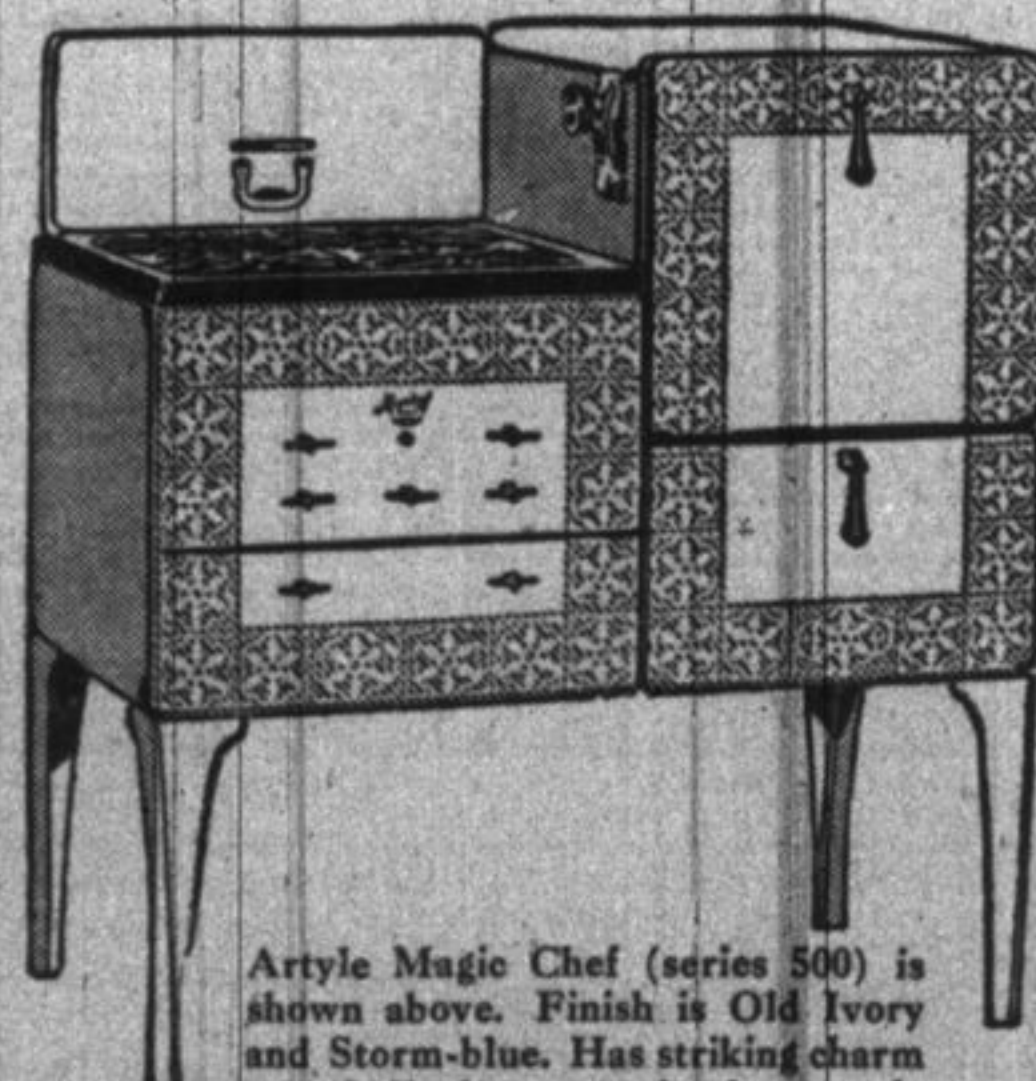
Artyle Magic Chef (series 500) is shown above. Finish is Old Ivory and Storm-blue. Has striking charm—and all advantages that have made Magic Chef famous.