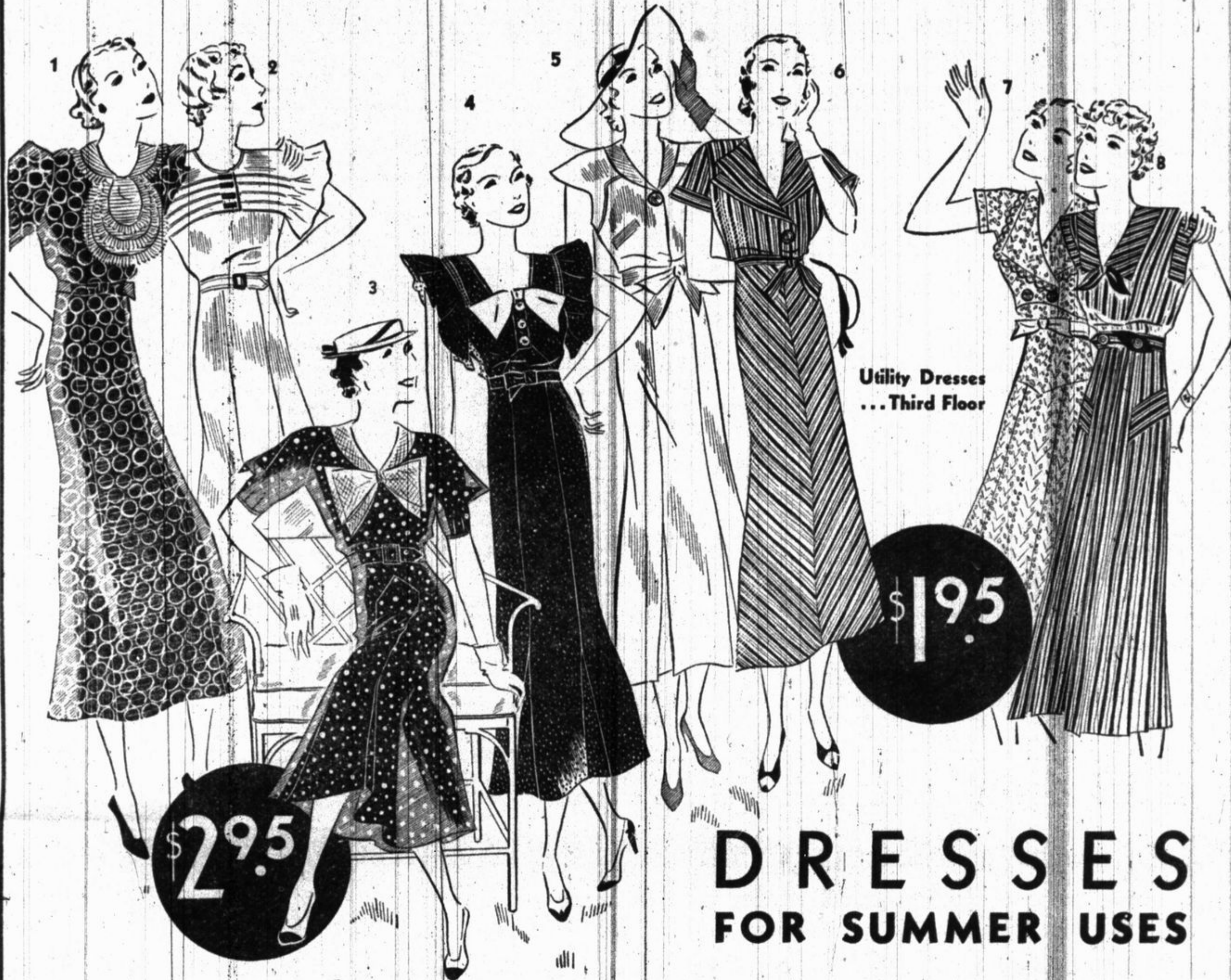
Utility Dresses ... Third Floor

Typical Highlights From More Than 250 Values For "Suburban Store Week"