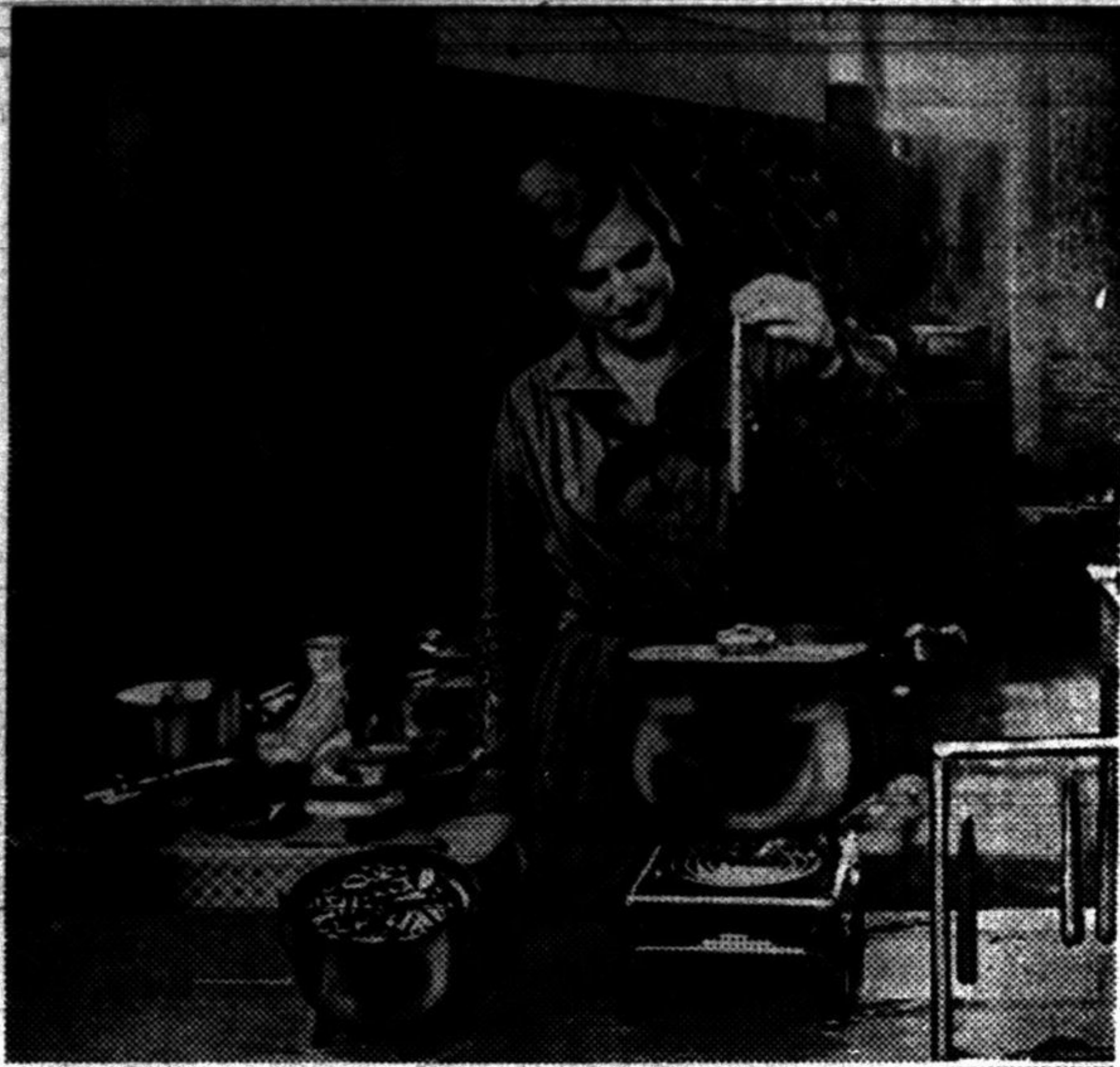
BAYBERRIES TO BURN! With deft fingers this Girl Scout rolls her own bayberry candles, thus combining a knowledge of craftsmanship with economy. She boils the berries, collects the wax, inserts a wick, and another candle is ready to shed its light at Christmas time.