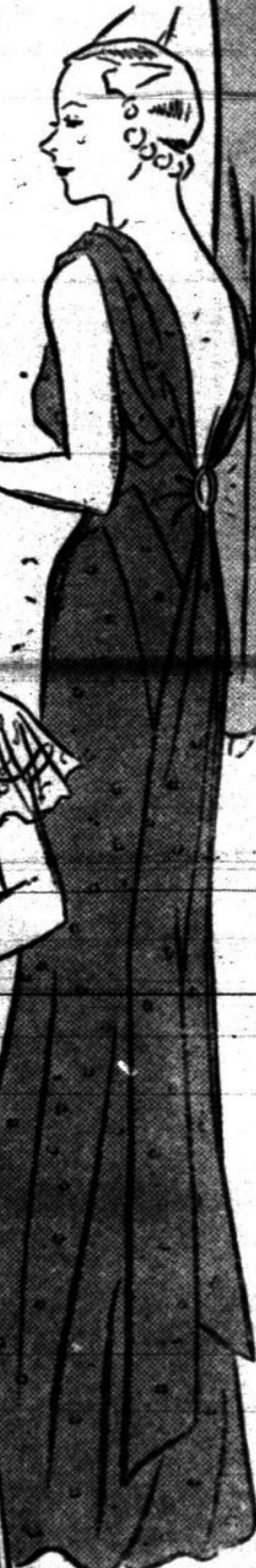
Green Bagheera crepe studded with brilliants makes this frock the very latest in formal wear. Size 16.