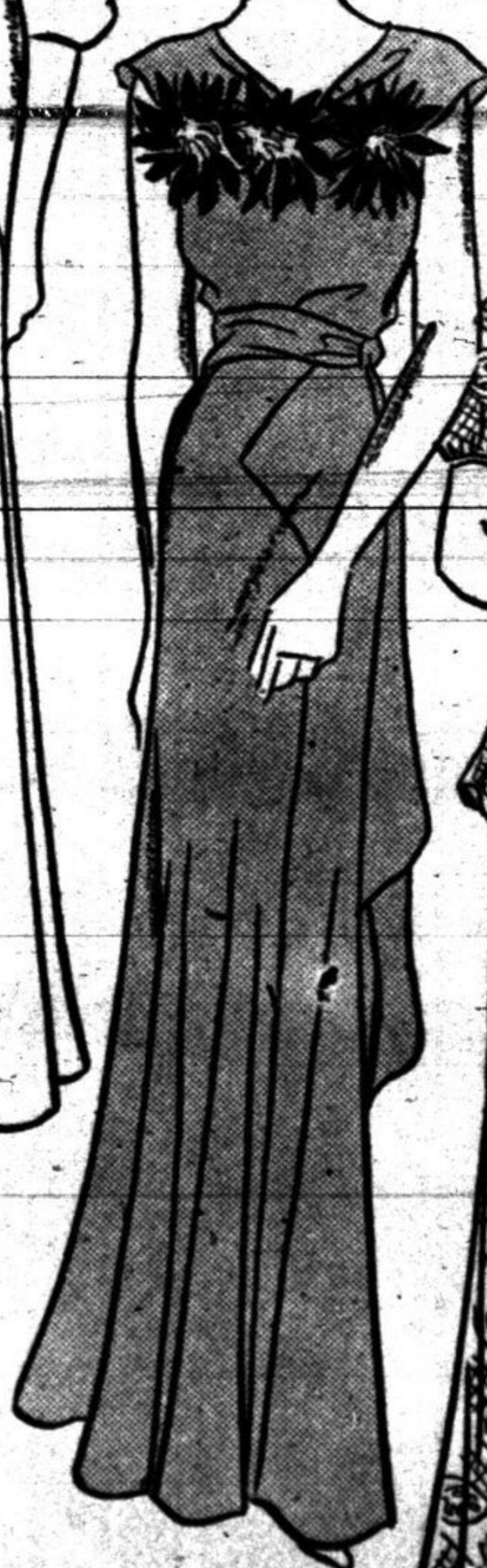
Brown and orange velvet flowers are smart accents to this dress of sheer gold crepe. Size 16.