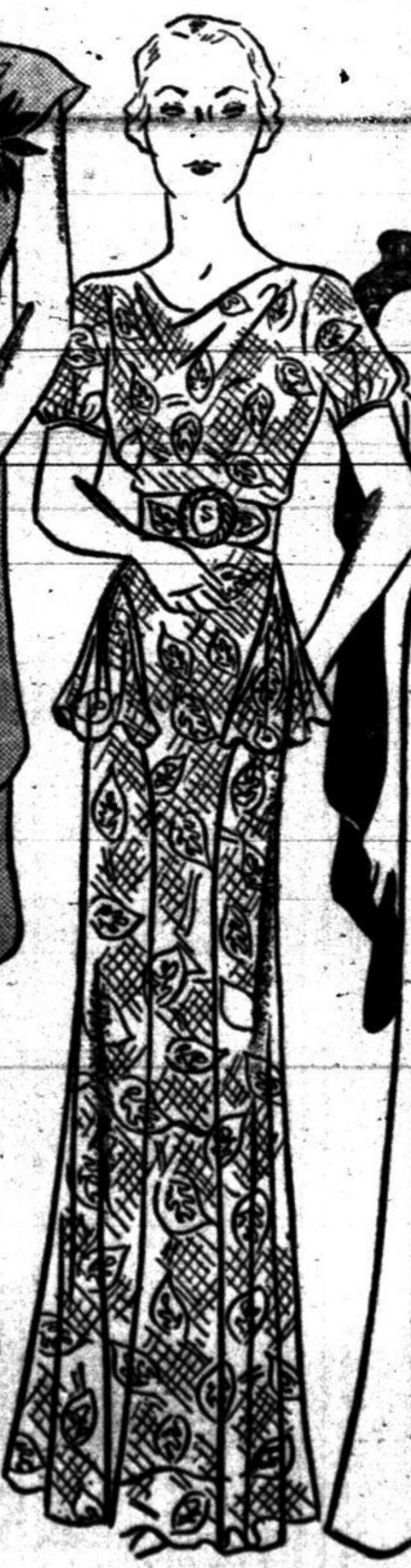
Very dainty, very feminine is this formal of fragile sky blue lace with an intricate gold buckle. Size 12. Chic, no end.