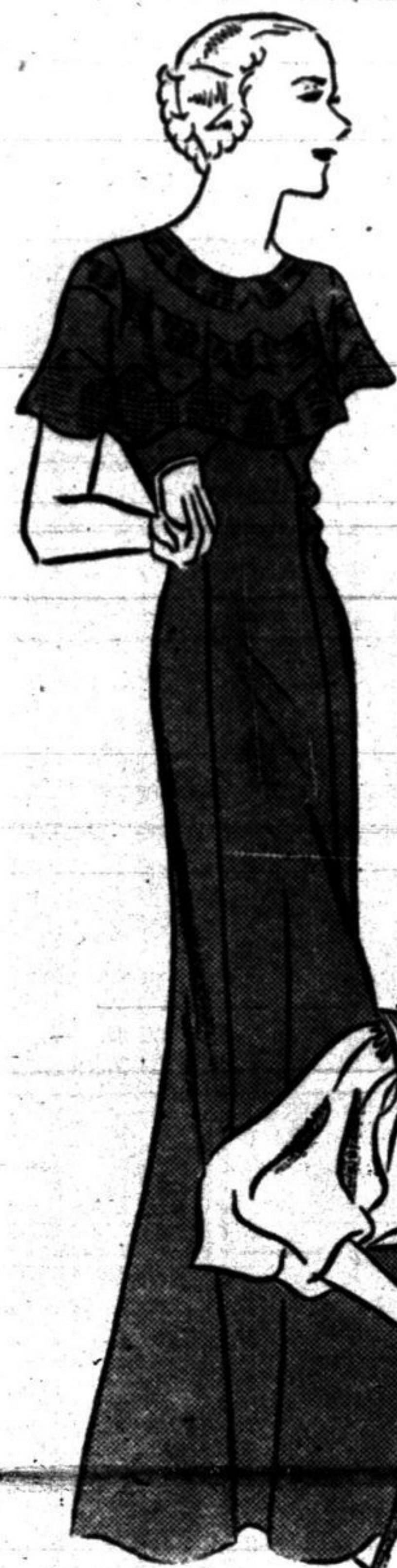
A sophisticated dress of hyacinth blue satin with a graceful sheer, beaded cape. In size 16.

In the Apparel Section— LORD'S—Second Floor