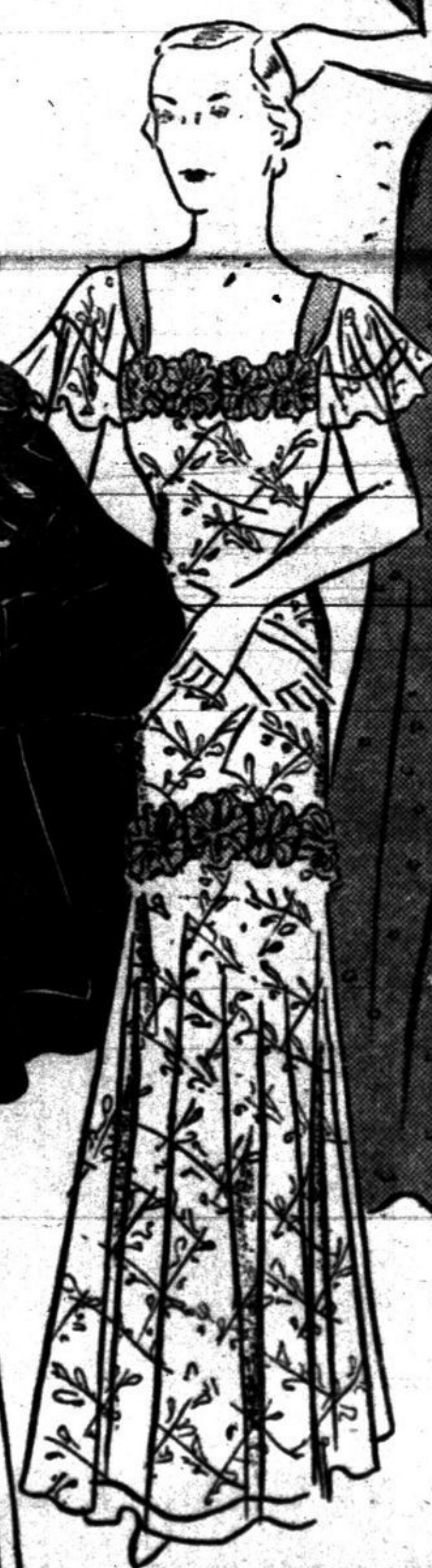
A sparkling frock of tinsel net over a turquoise slip with matching velvet flowers. Size 14.