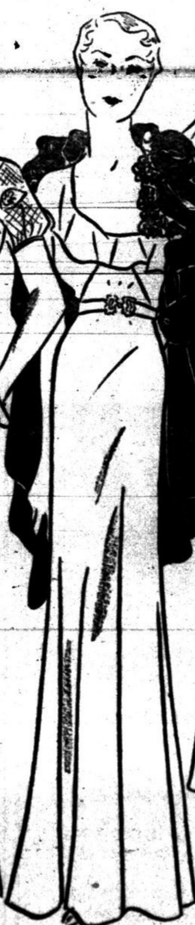
A white crepe dress complete with a red velvet coat for holiday festivities. The dress repeats the red in the corsage. Size 14.