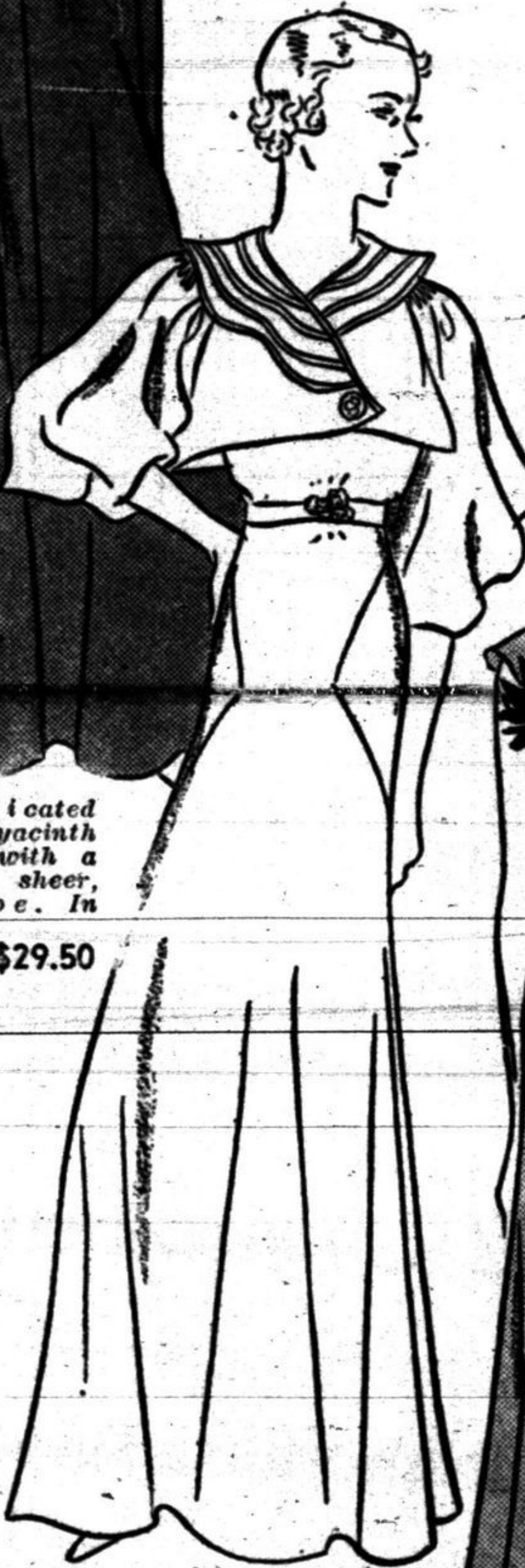
The fascinating corded collar on this white taffeta frock gives it an air of naivete. Size 12.