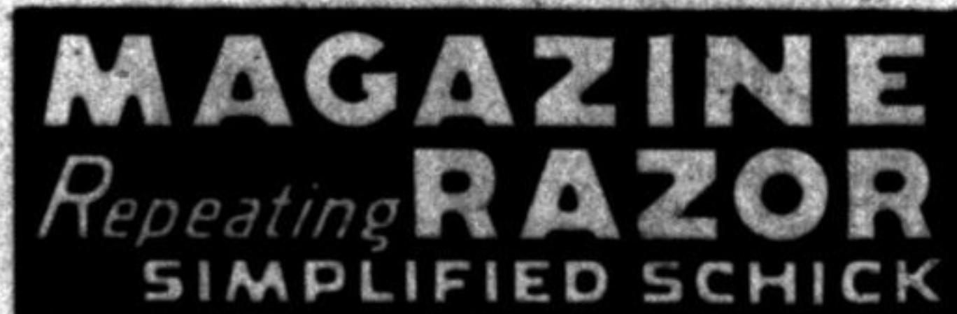
20 blades in the handle

MAGAZINE REPEATING RAZOR COMPANY, 230 PARK AVENUE, NEW YORK, N. Y.