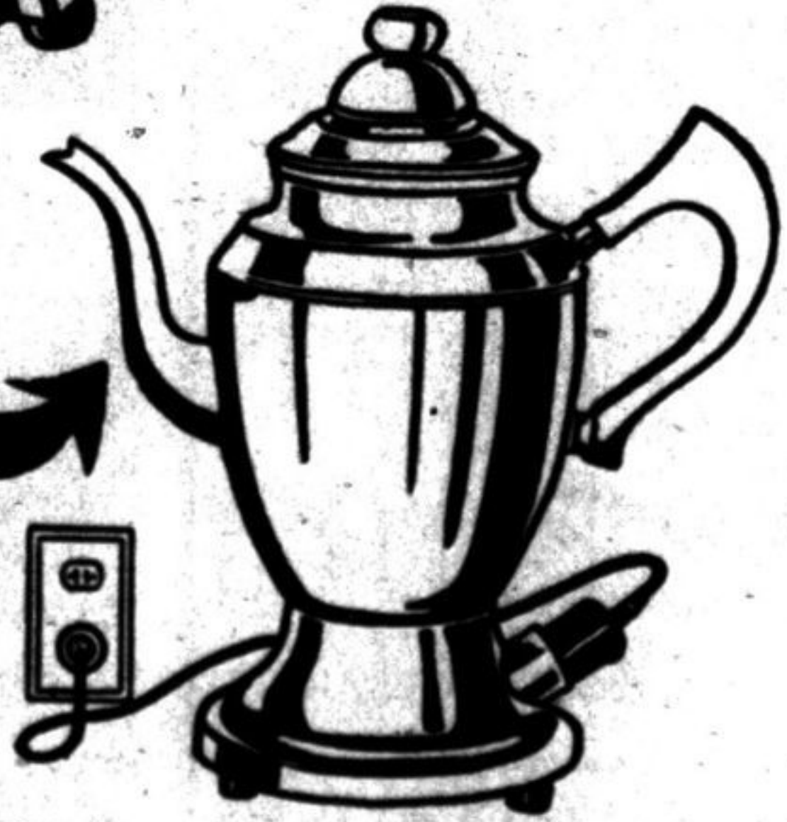
Below. Full-size percolator. Copper finished in chrome. Instantaneous heating element. Comes with 6-ft. cord.