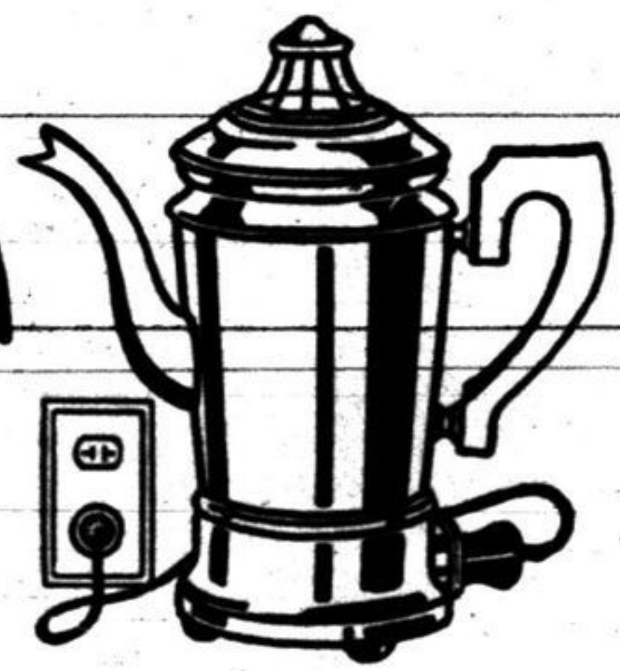
Above. Handy small-size percolator. Solid copper with chromium finish. 6-ft. cord.