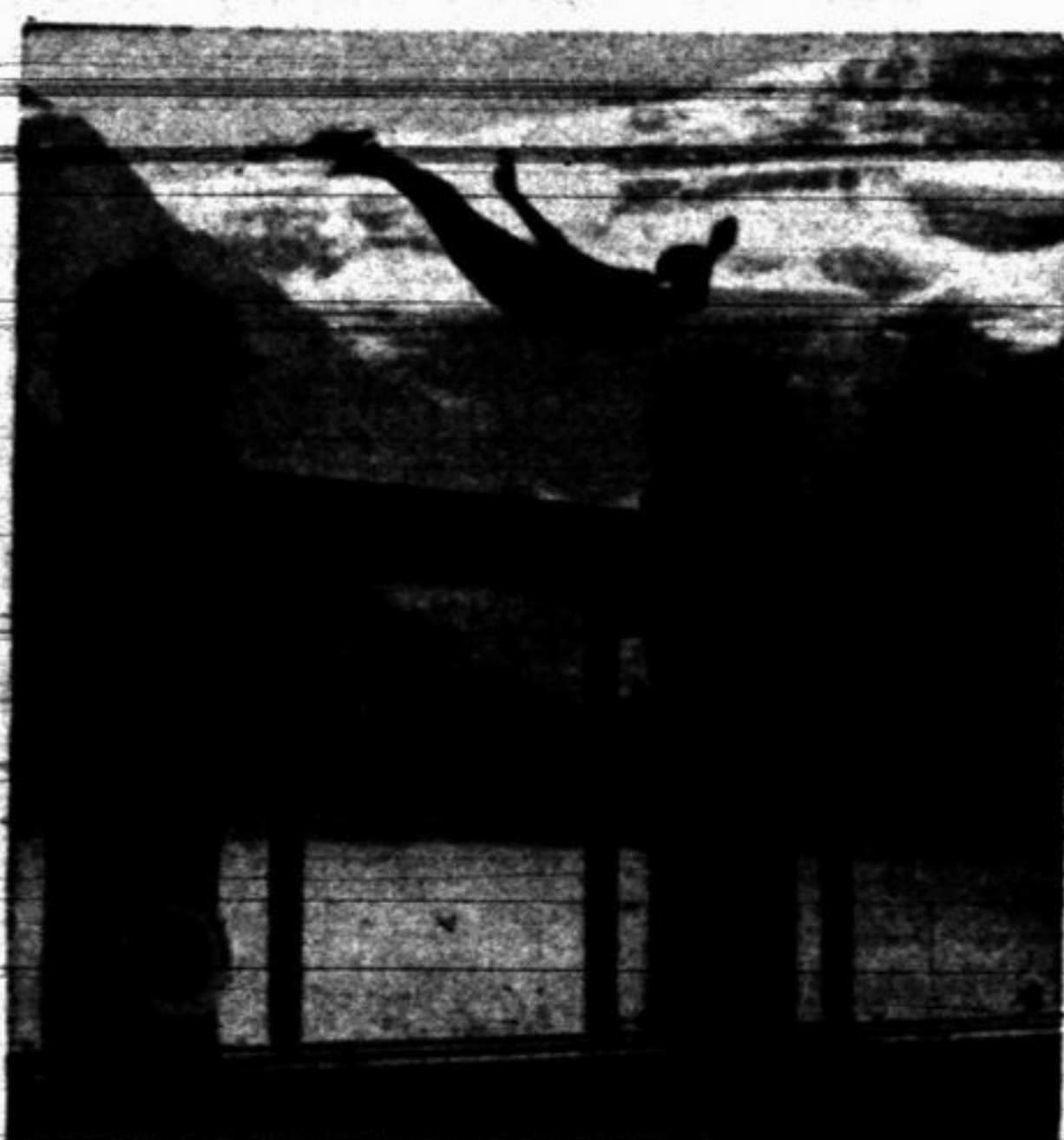
Swimming at Lake Louise —in a beautiful protected pool—with near-to-heaven sunshine and a snow-crowned mountain back-drop!