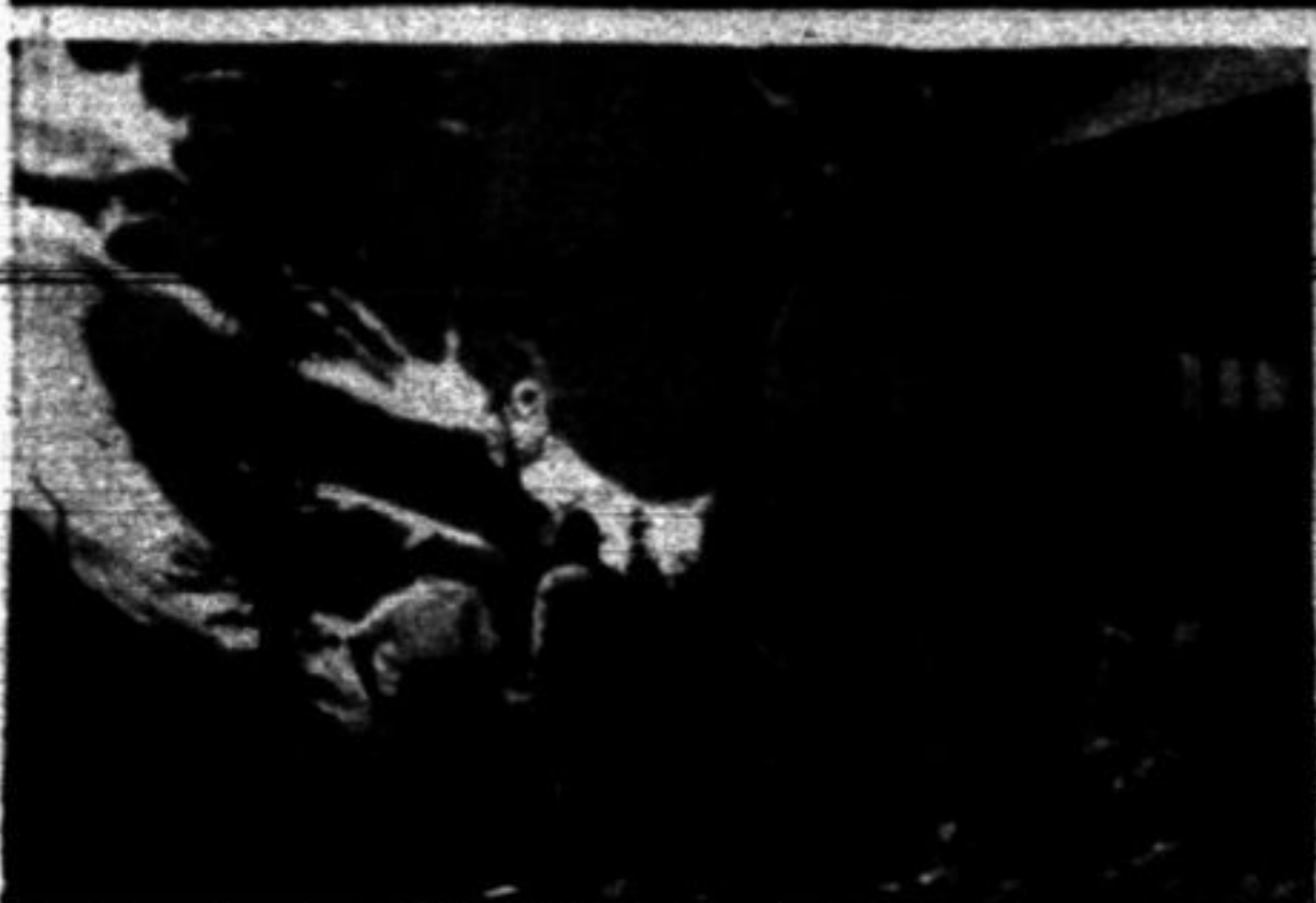
Pure Romance! Cozy Chalet-Bungalow camps are tucked away in the wilds in the very heart of the Rockies' wonders.