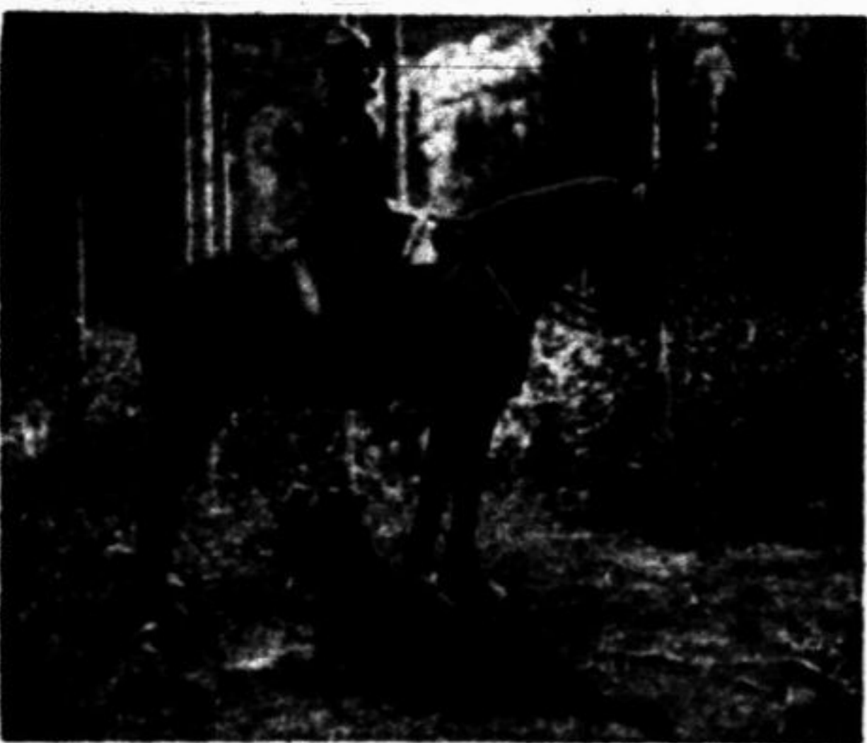
Banff is headquarters for a division of the famous Northwest Mounted Police. Rich in tradition, colorful, these "Mounties" are verily a part of the place!