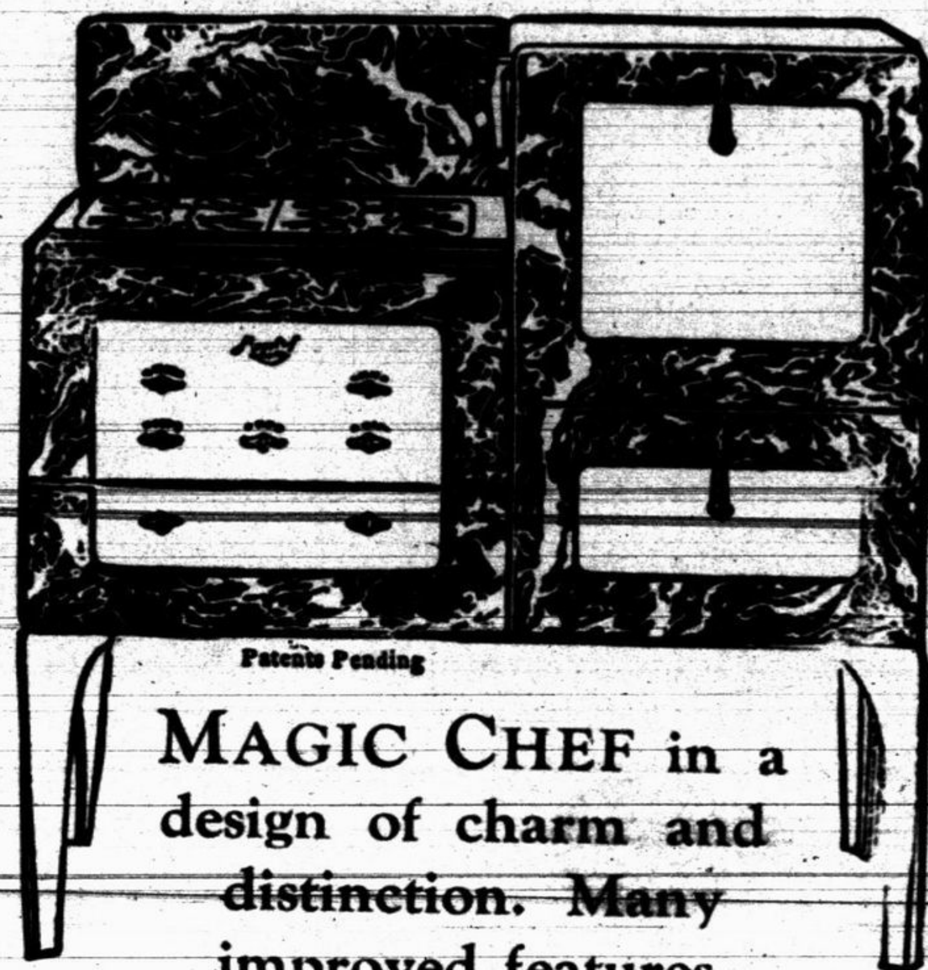
Patents Pending MAGIC CHEF in a design of charm and distinction. Many improved features.