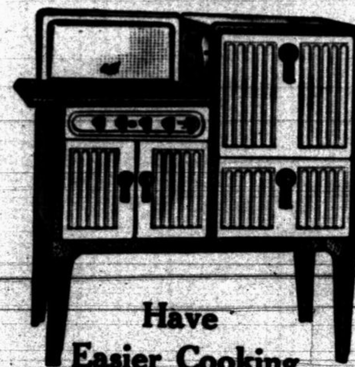
Have Easier Cooking with this Trim Model