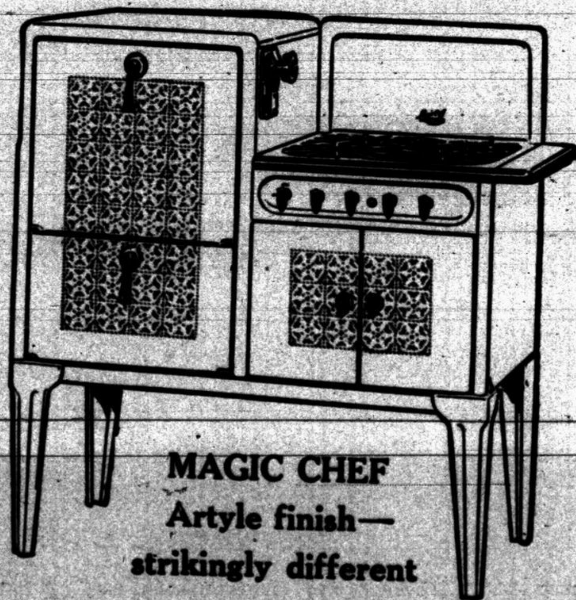
MAGIC CHEF Artyle finish— strikingly different