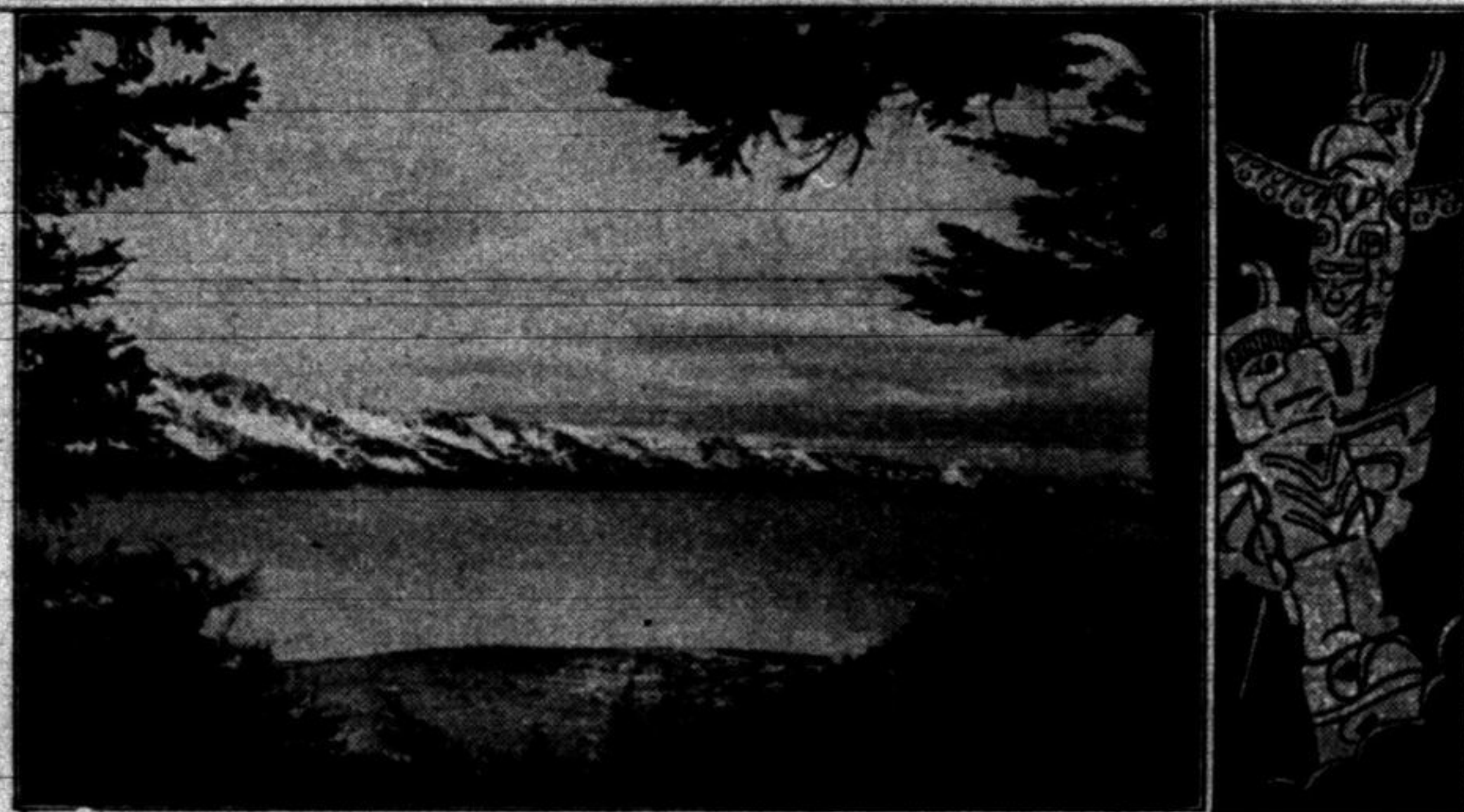
Alaska Coast Range and Resurrection Bay