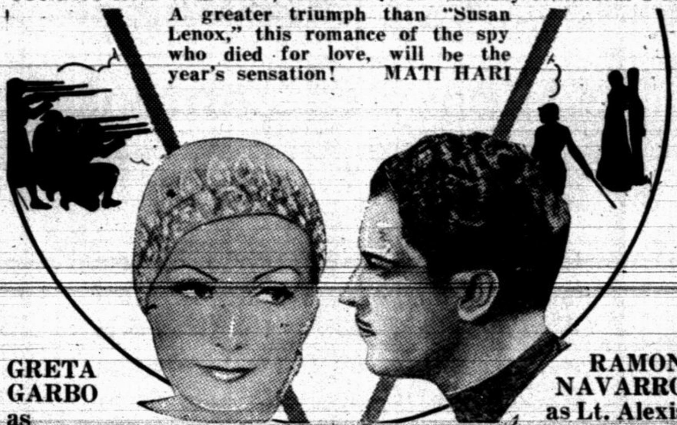
GRETA GARBO as Mata Hari

A greater triumph than "Susan Lenox," this romance of the spy who died for love, will be the year's sensation! MATA HARI