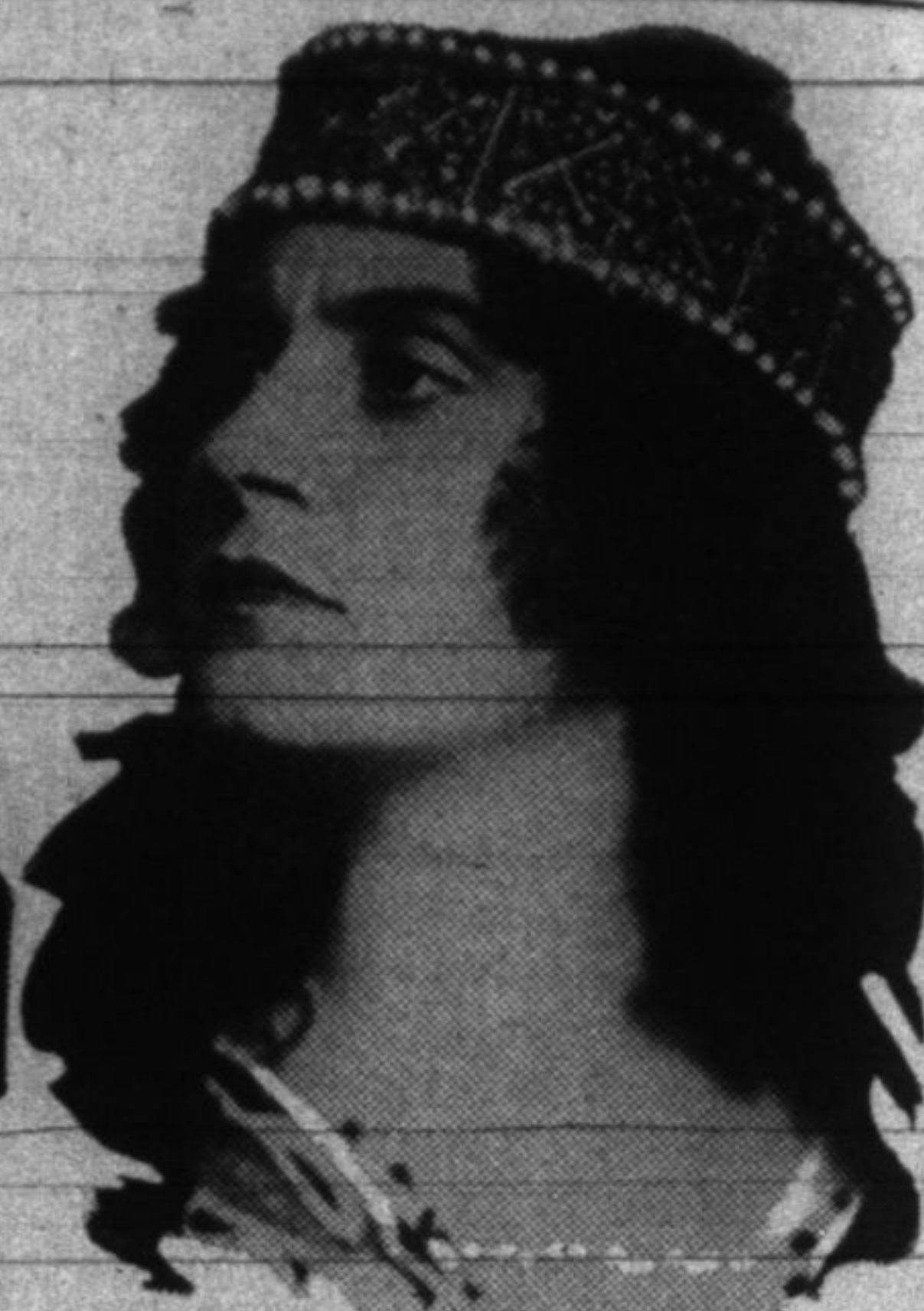
MARIA OLSZEWSKA as Ortrud

The eleventh week of opera saw Madame Lotte Lehmann, one of Europe's greatest favorites, again in the casts. Her first performance was as Elsa in Wagner's Lohengrin on Wednesday, (last week), and for this opera the Chicago Civic Opera mustered what was probably the greatest cast to be found anywhere in the world. Madame Lehmann will again appear in Lohengrin next Thursday, Jan. 21. Egon Pollak, beloved Wagnerian authority, was at the conductor's desk, and on the stage with Madame Lehmann were Madame Maria Olszewska as Ortrud, a role which is considered by many as her finest characterization; Rene Maison, the outstanding exponent of the part of our day as Lohengrin; Hans Hermann Nissen in his brilliant characterization of Telramund; Alexander Kipnis as King Henry, another magnificent portrayal, and Eduard Habich mak-