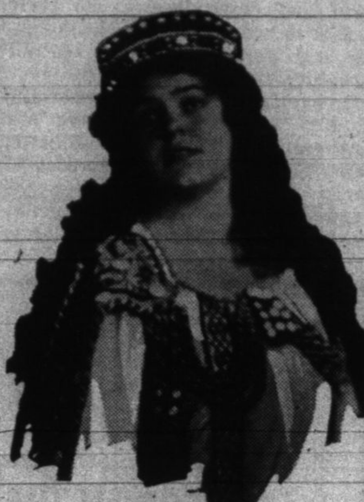
LOTTE LEHMANN as Elsa