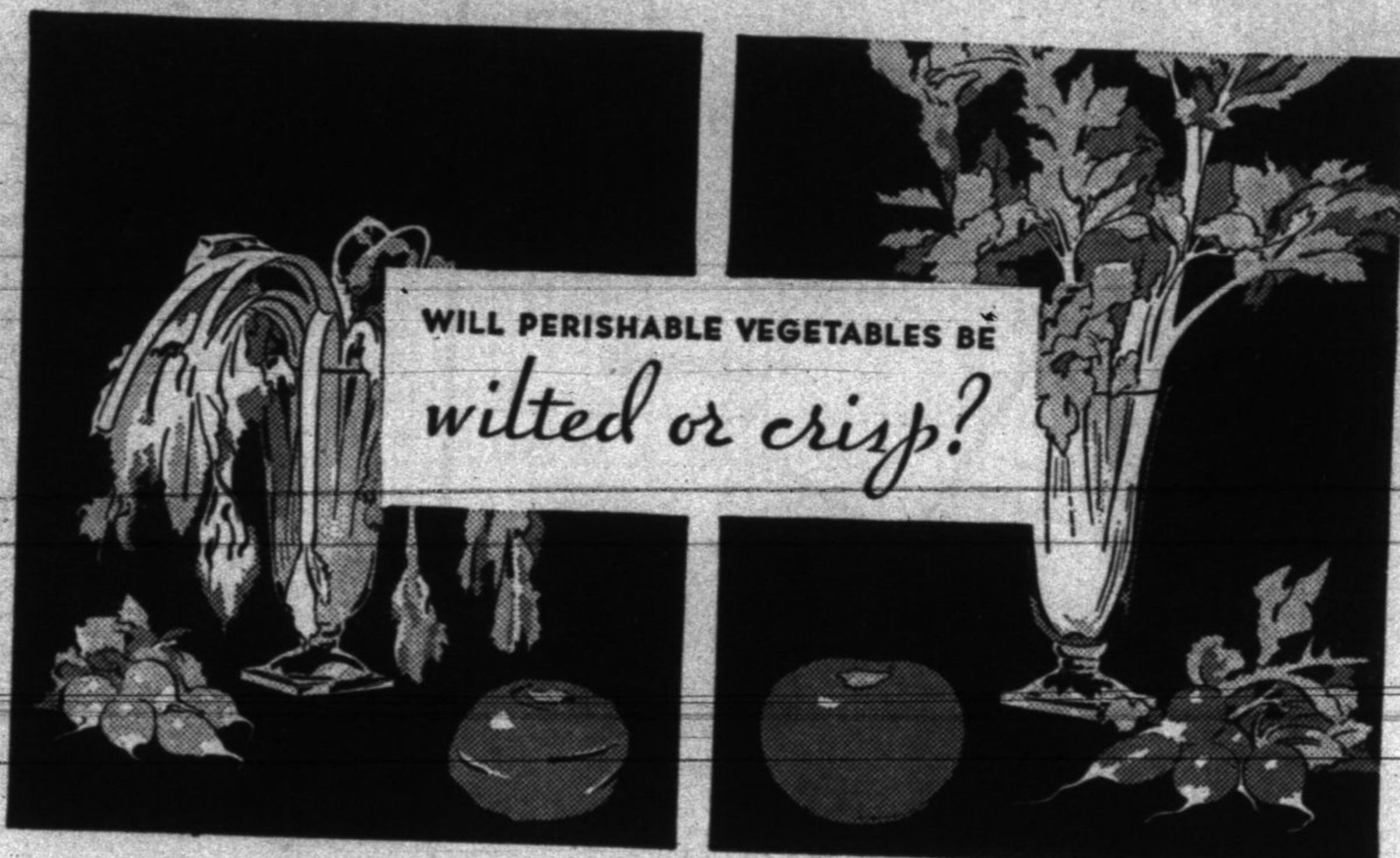
Lack of proper moisture results in wilted and dried-out vegetables. The moist cold of the Frigidaire Hydrator keeps vegetables crisp, firm and fresh.

only FRIGIDAIRE... OFFERS ALL THE FEATURES OF "ADVANCED REFRIGERATION"