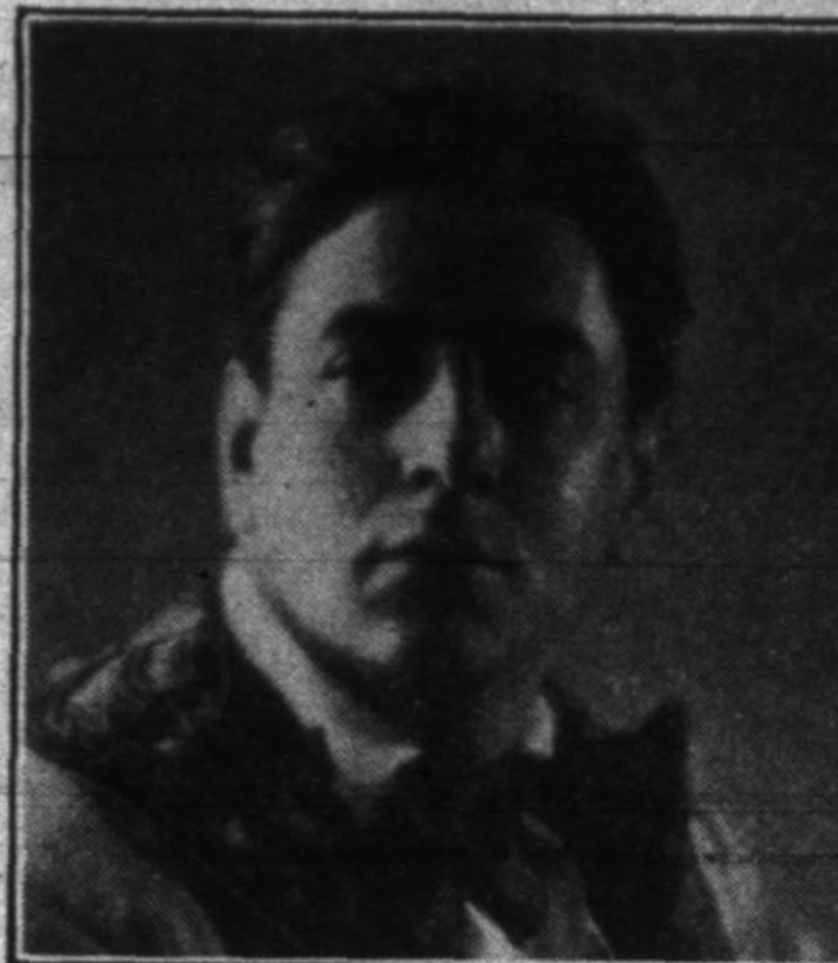
Tito Schipa Who Rejoins Company Soon