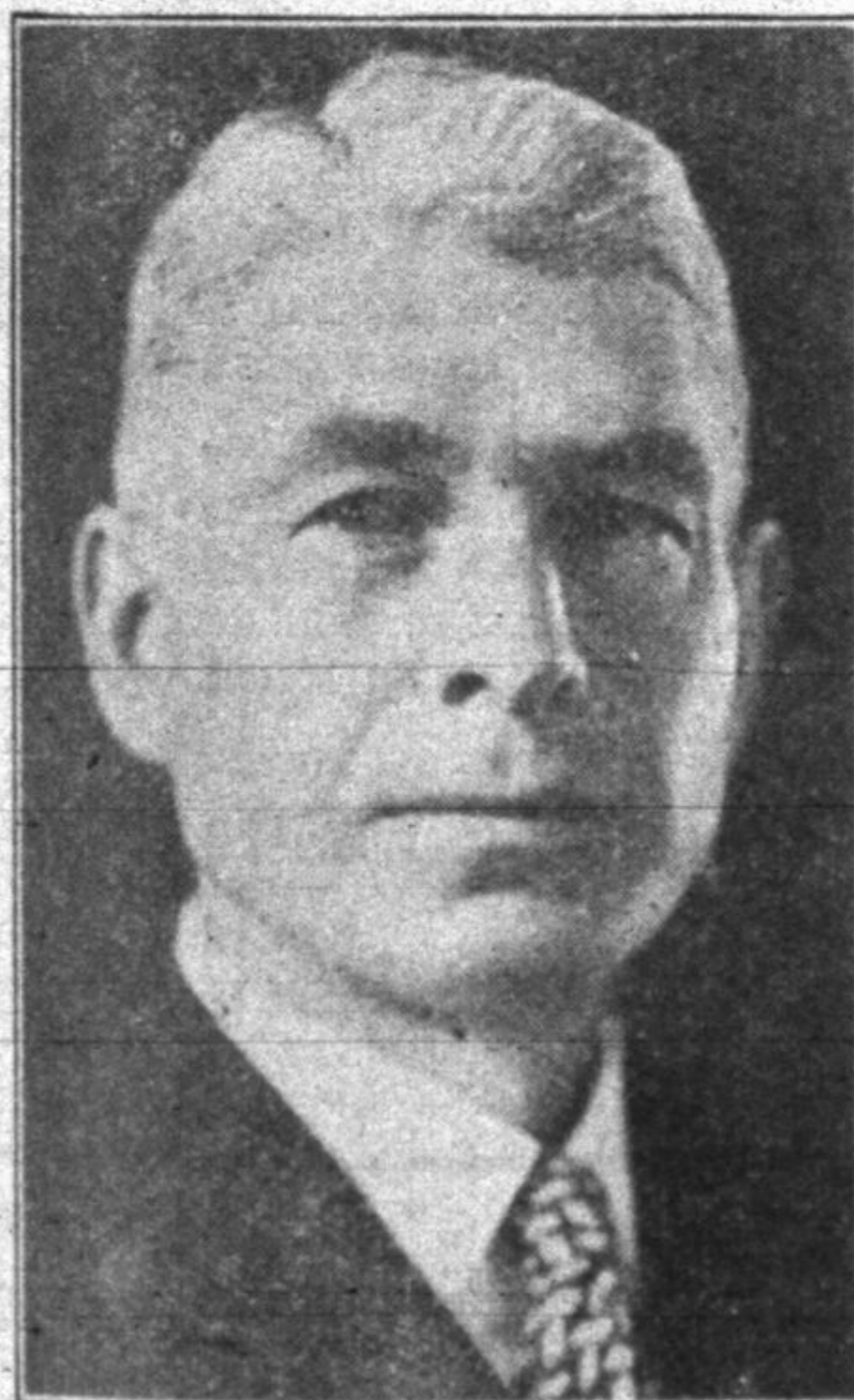
KARL D. KING President 1928-1929 Now Representative to the National Council B. S. A.