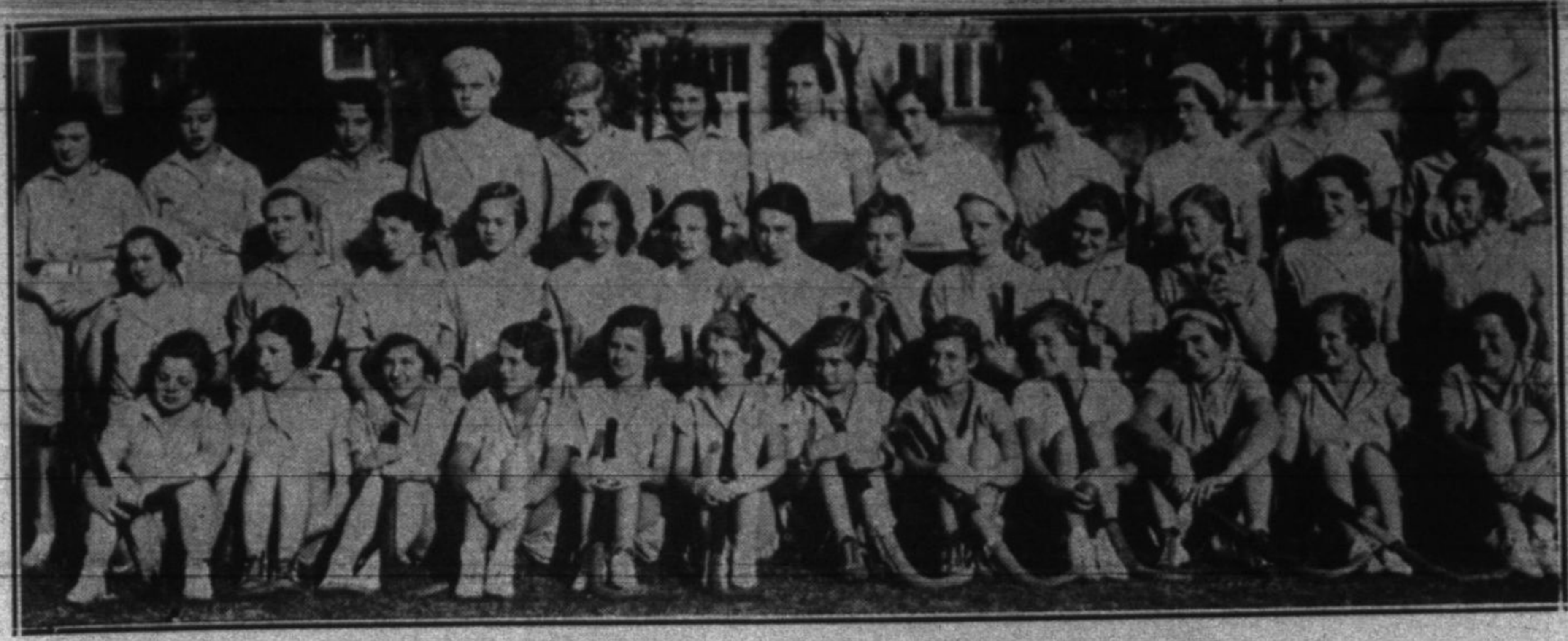
DEERFIELD-SHIELDS' JUNIOR GIRLS HOCKEY TEAM