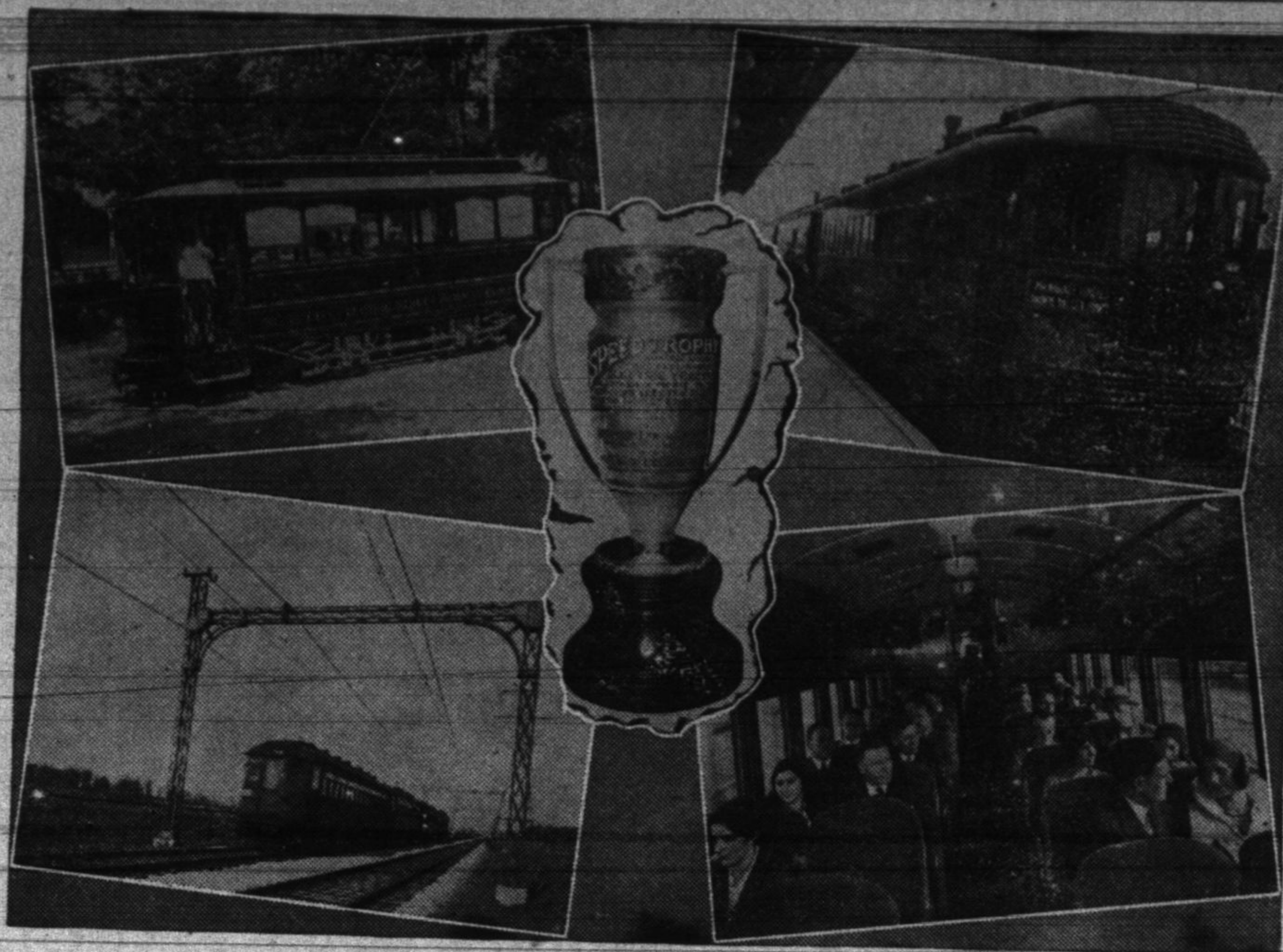
NORTH SHORE LINE WINS SPEED TROPHY