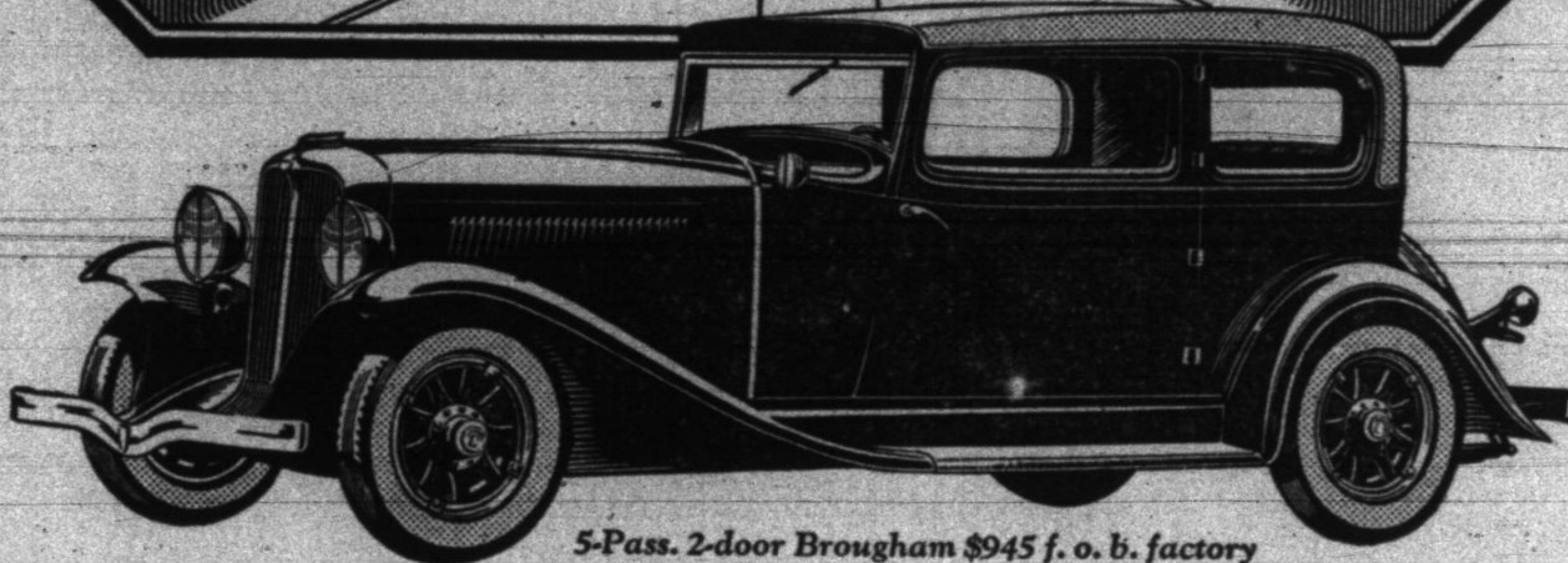
5-Pass. 2-door Brougham $945 f. o. b. factory

Quality construction has simply been poured into the new Auburn Straight Eight. For example, it has the strongest, most rigid frame. The only car with X-type twist-proof frame, affording greater road comfort and durability. Auburn Custom Models are the only cars with Silent-Constant Mesh and L. G. S. Free Wheeling combined. No wonder Auburn sales are ahead. More value for less money. That is the secret of Auburn's success and the reason why you should investigate the new Auburns at once.