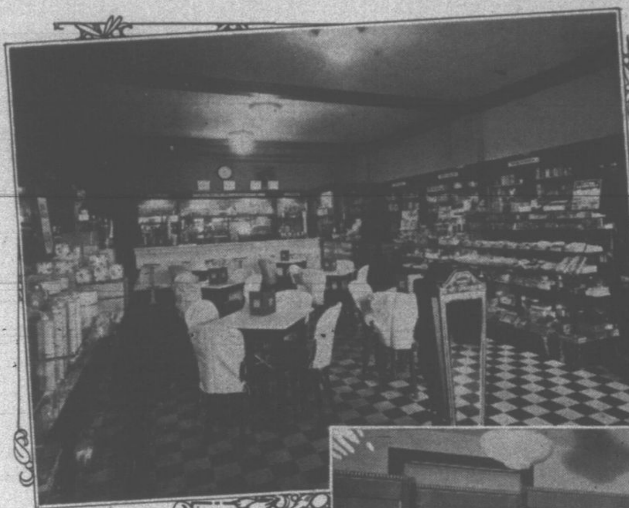
389 Central Avenue