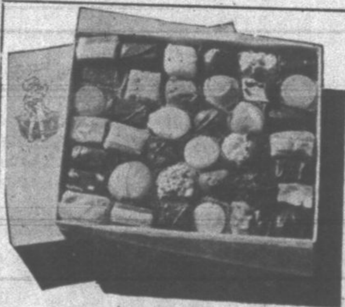
WEEK-END SPECIAL BOX Miss Ring-Ting Assortment $1.00 Ring-Ting Candy Shops 33 North Sheridan Road

Twentieth Season JUNE 20th to AUGUST 31st Box office open 9:30 a.m. until 10 p.m. daily and Sunday PHONE HIGHLAND PARK 2727