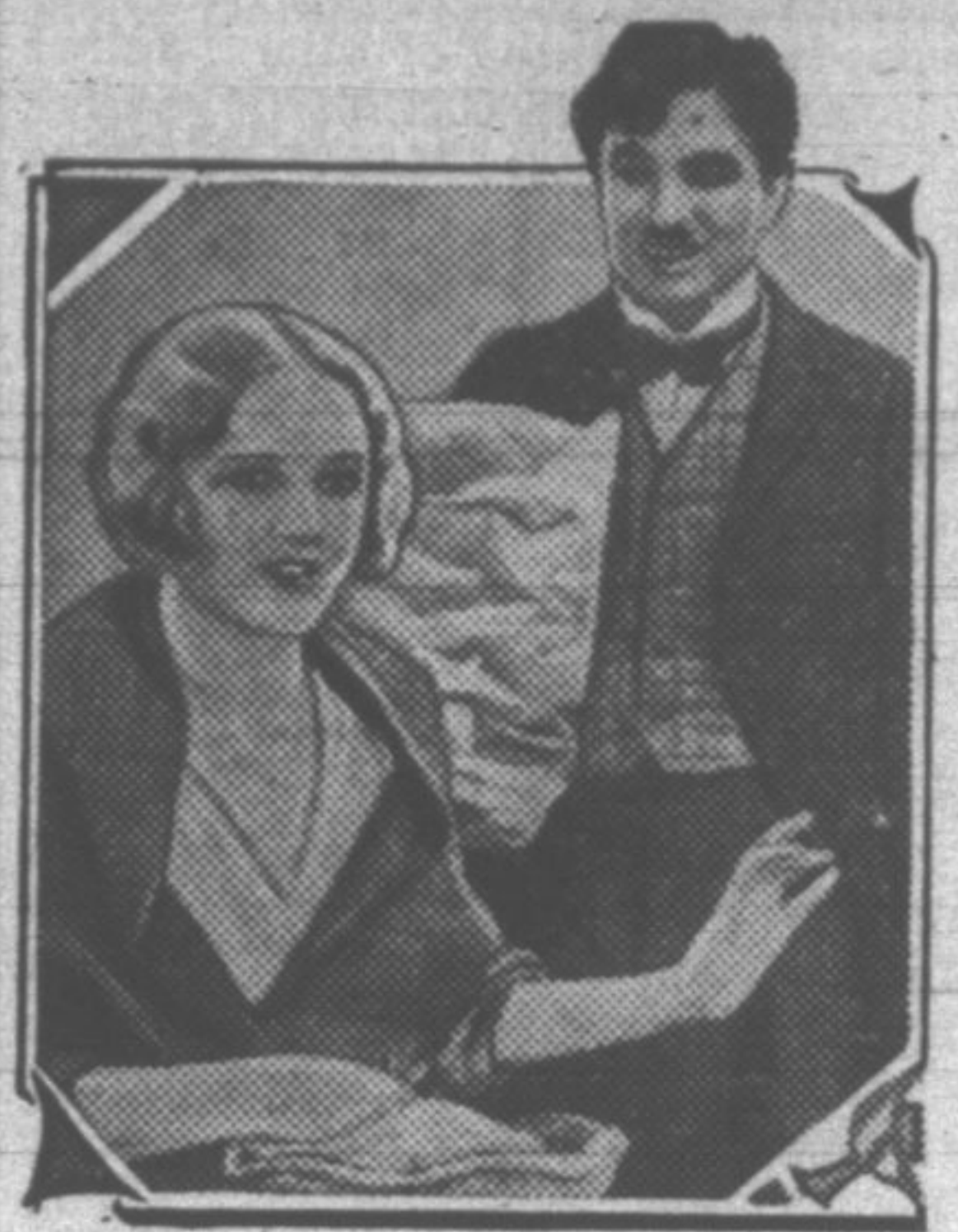
Charlie Chaplin in a scene from "City Lights"