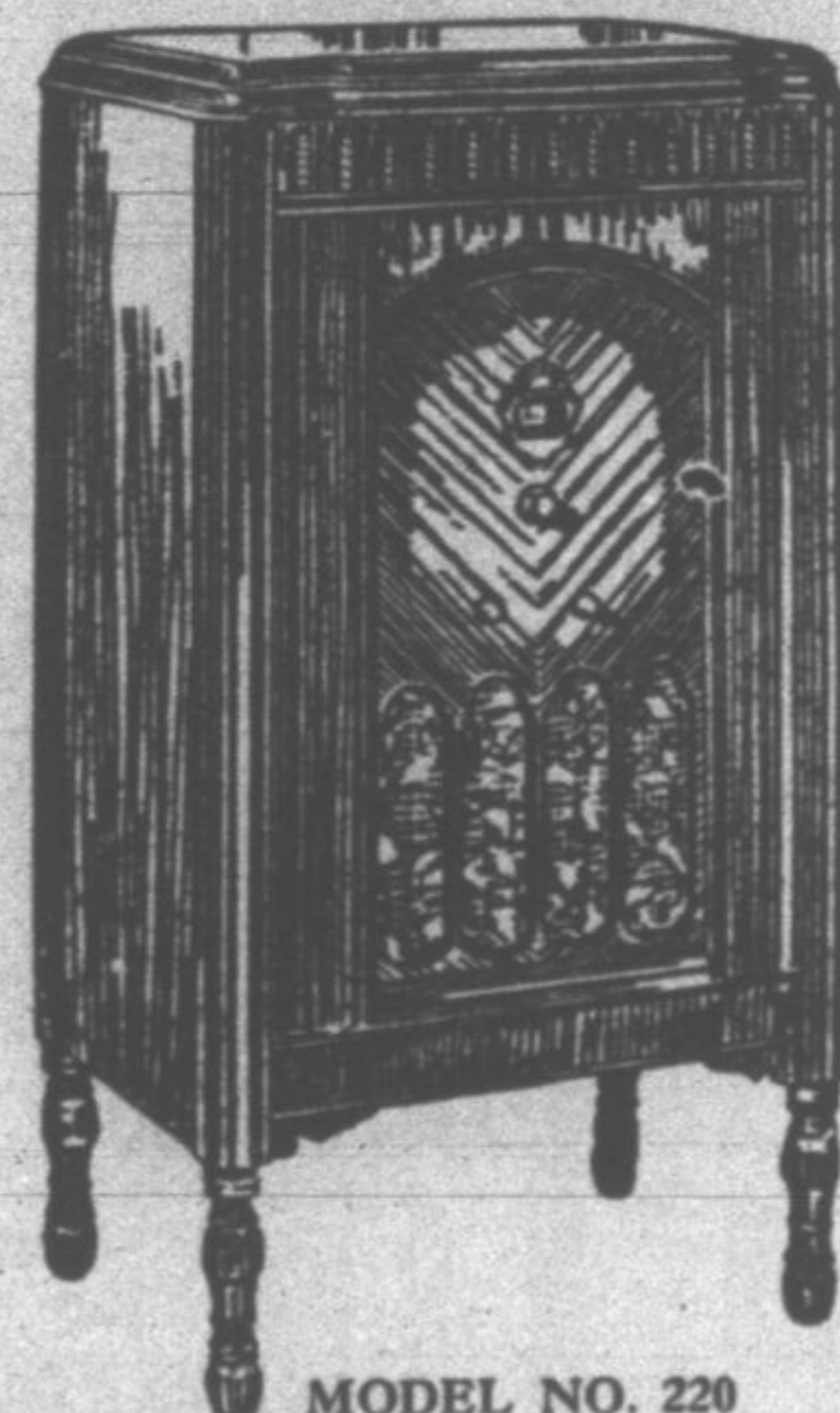
MODEL NO. 220 The famous PHILCO Screen Grid Combination. Formerly sold for $118.00 Trade in allowance $40.00