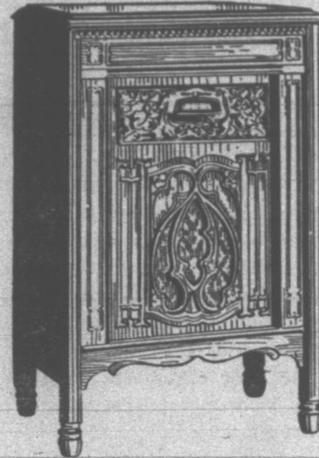
VICTOR RE-17 combination, formerly sold at $189.50.