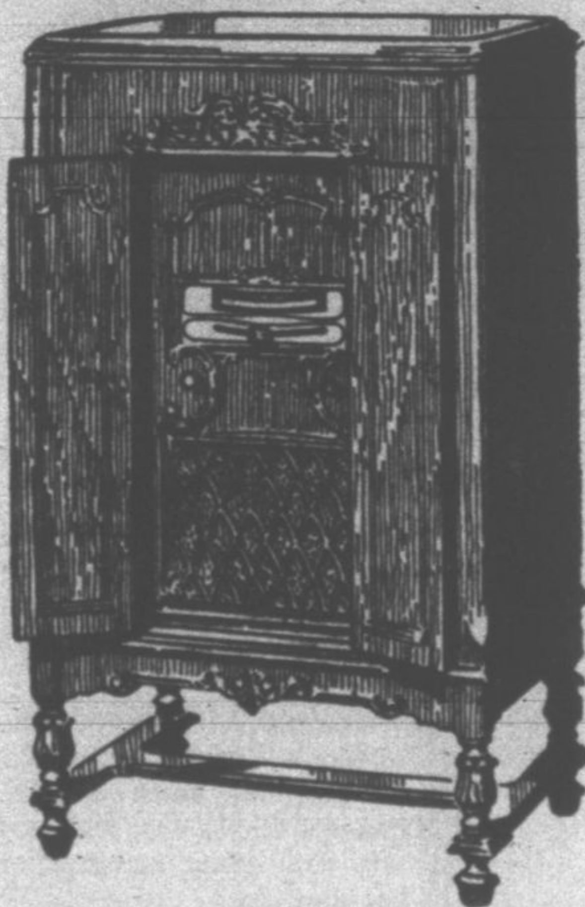
VICTOR RE-57. The finest model ever built. Includes home recording. Formerly sold at $306.30.