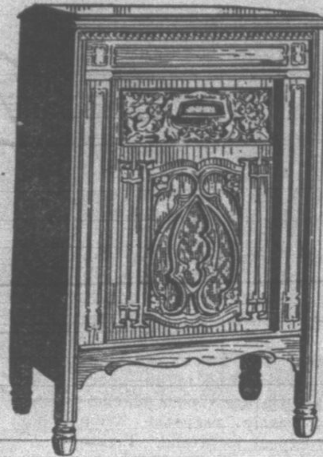
VICTOR RE-17 combination, formerly sold at $189.50.