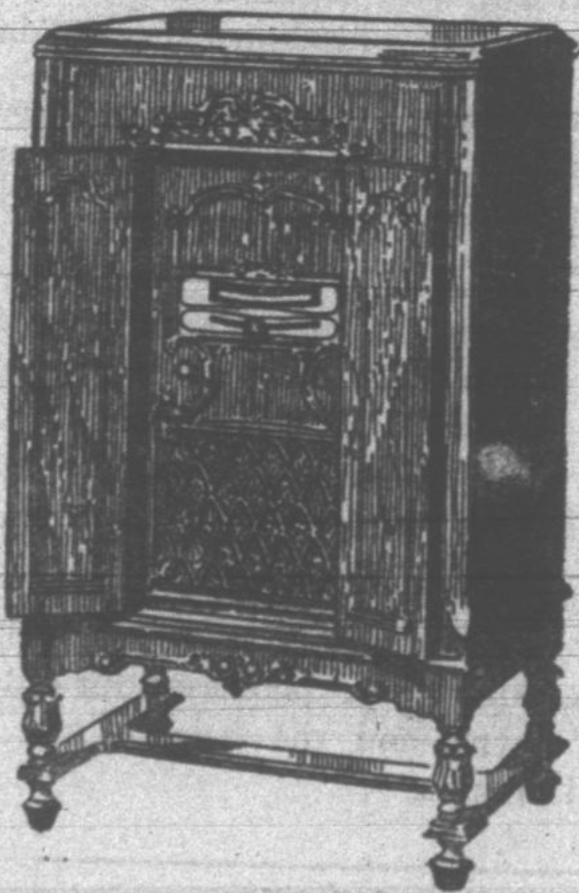
VICTOR RE-57. The finest model ever built. Includes home recording. Formerly sold at $306.30.