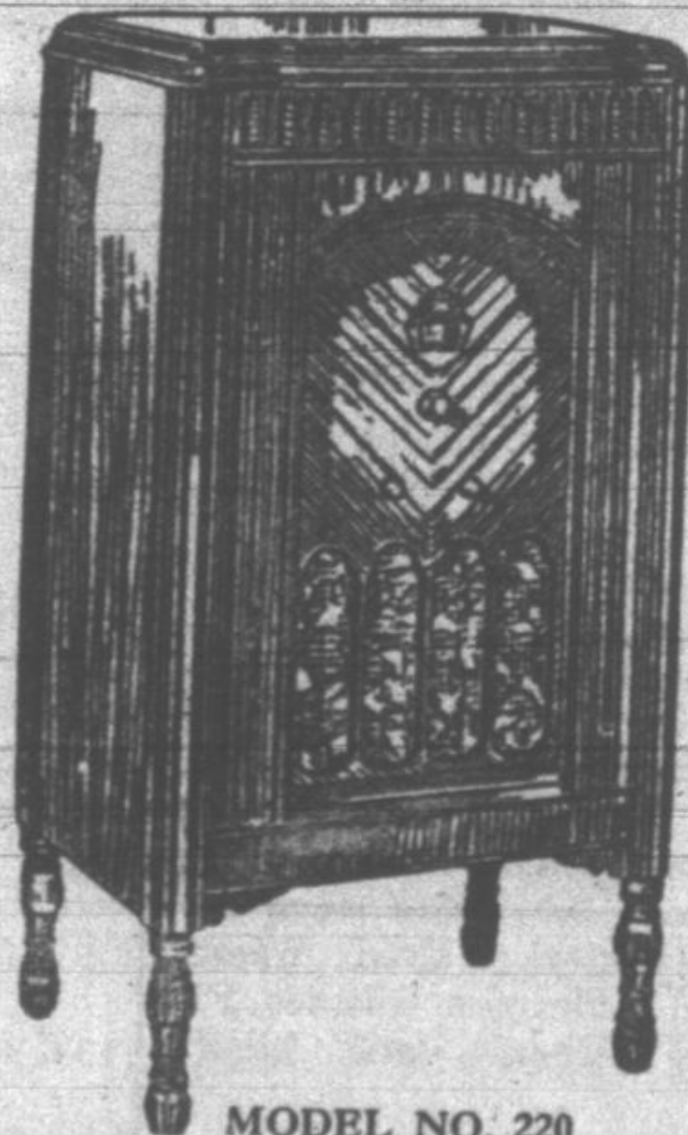
MODEL NO. 220 The famous PHILCO Screen Grid Combination. Formerly sold for $118.00. Trade in allowance $40.00