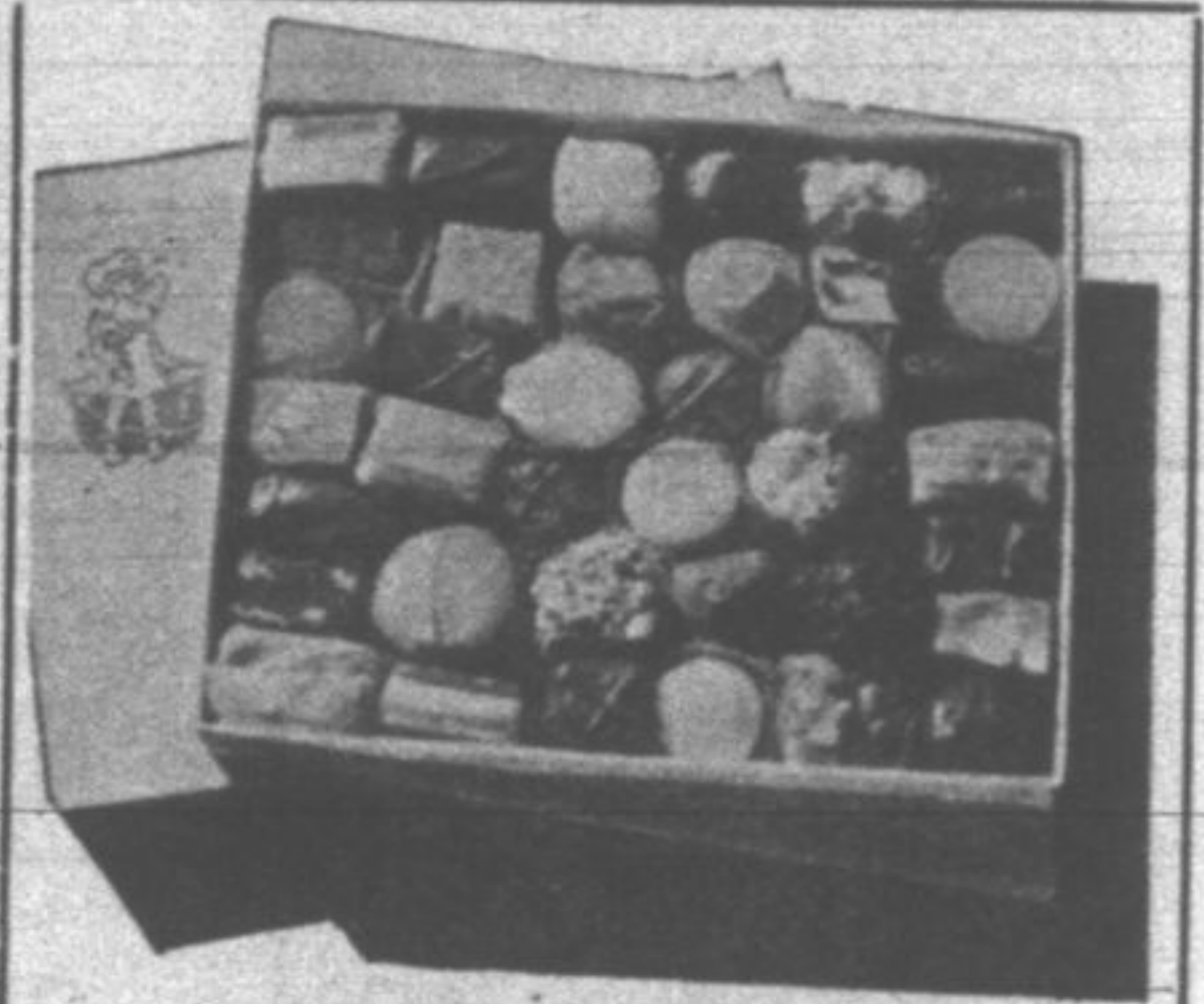
WEEK END SPECIAL BOX Miss Ring-Ting Assortment $1.00

Tune in Radio Station WCHI, Chicago, 1490 kilocycles, every Monday and Thursday sometime between 1:45 and 2:45 p. m. for the local merchants program for five weeks.