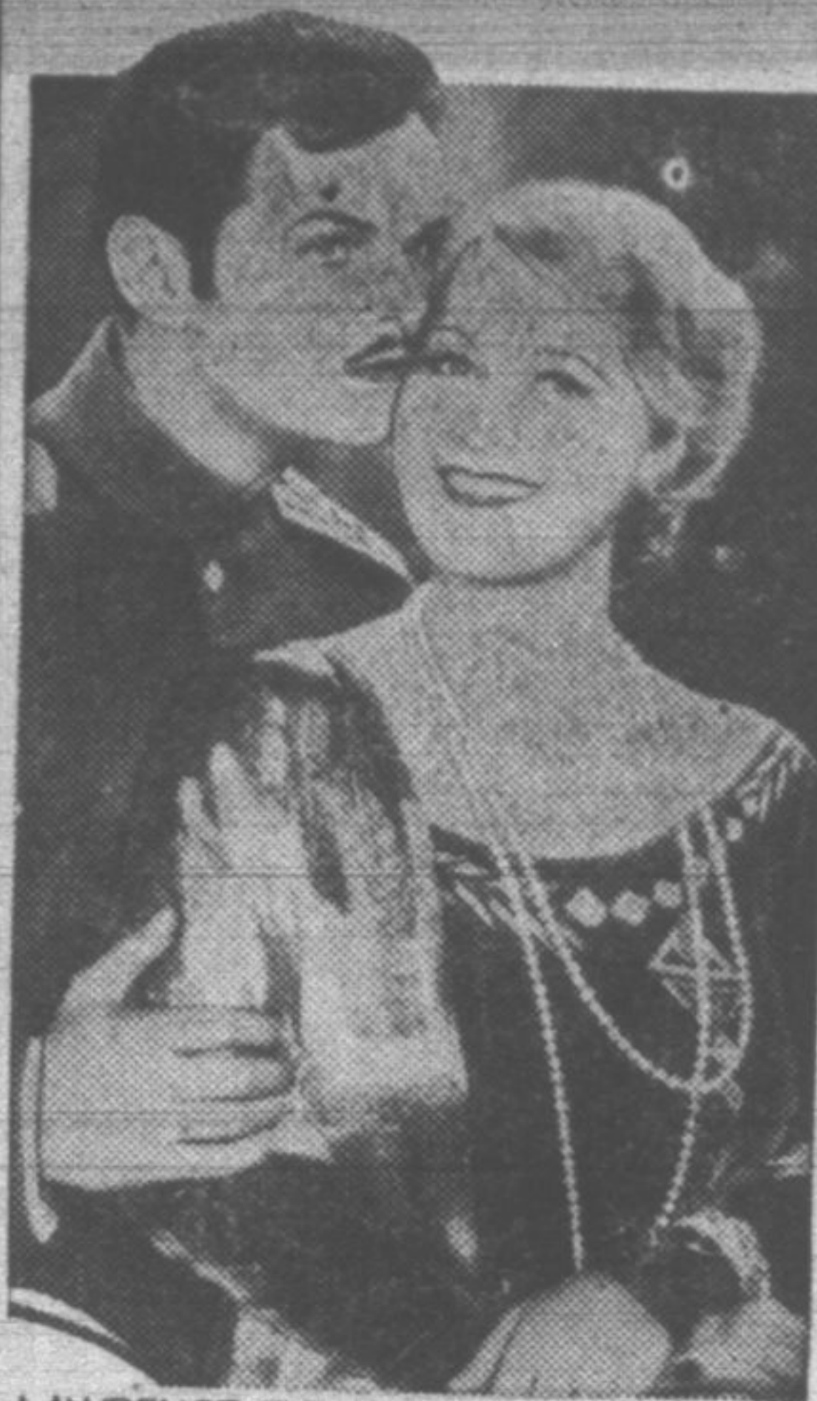
LAWRENCE TIBBETT and GRACE MOORE in "NEW MOON"