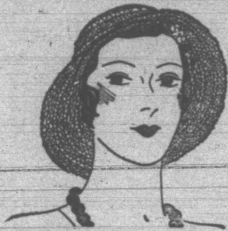
Watteau Hat of lacy rough straw with flower trimming under brim, $5.00.