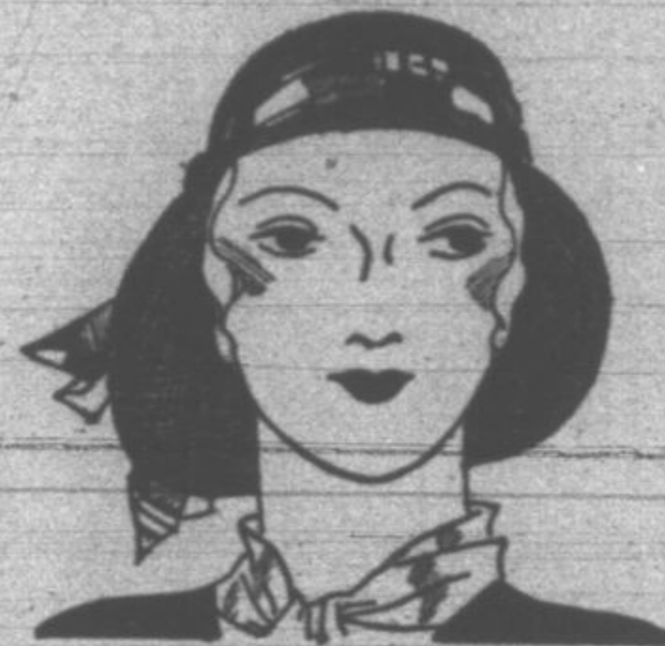
Tailored Hat of baku in brimmed style with soft band of plaid ribbon, $5.00.