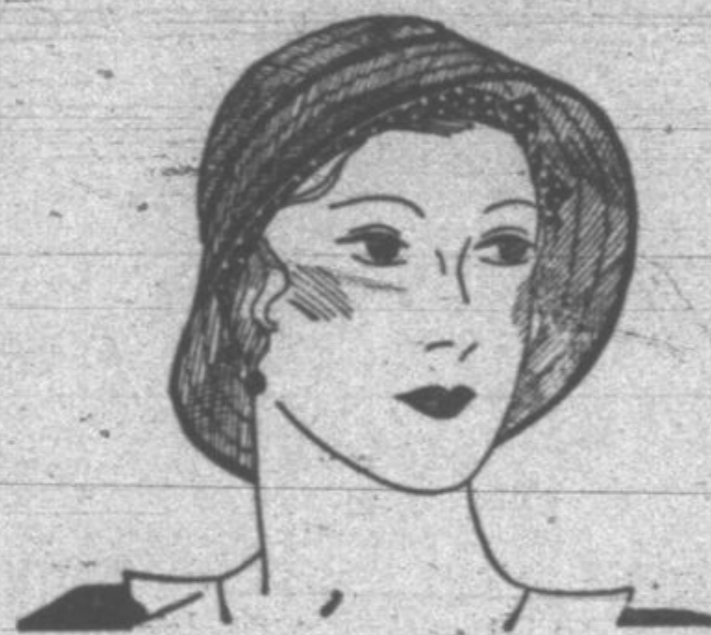
Bandeau Hat of transparent hair, with polka dot ribbon on bandeau, $5.00.