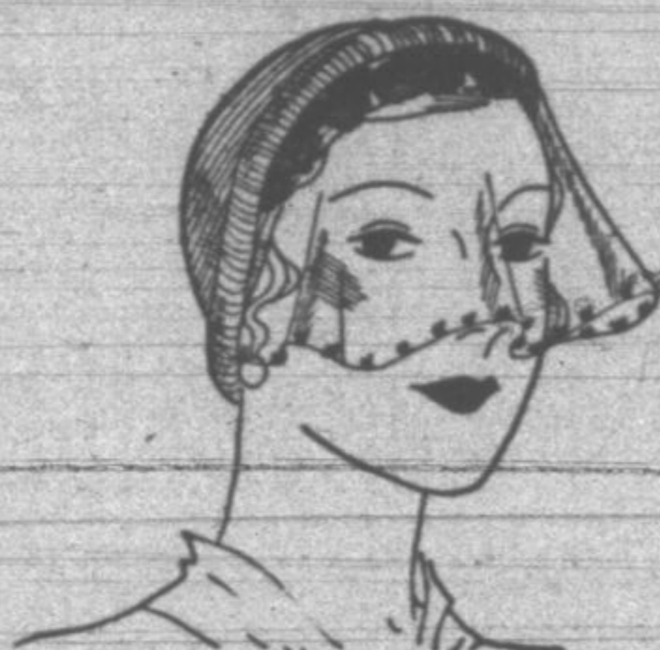
Halo Hat of hair, with trimming of contrasting flowers, $5.00.