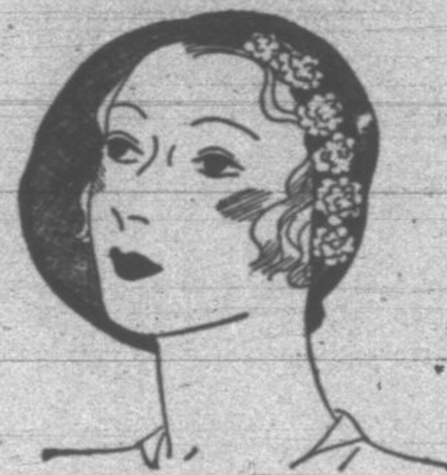
Uplift Brim Hat of panamalac body, with a row of dainty fabric flowers, $5.00.

In the Millinery Section—LORD'S—Second Floor, Davis St.