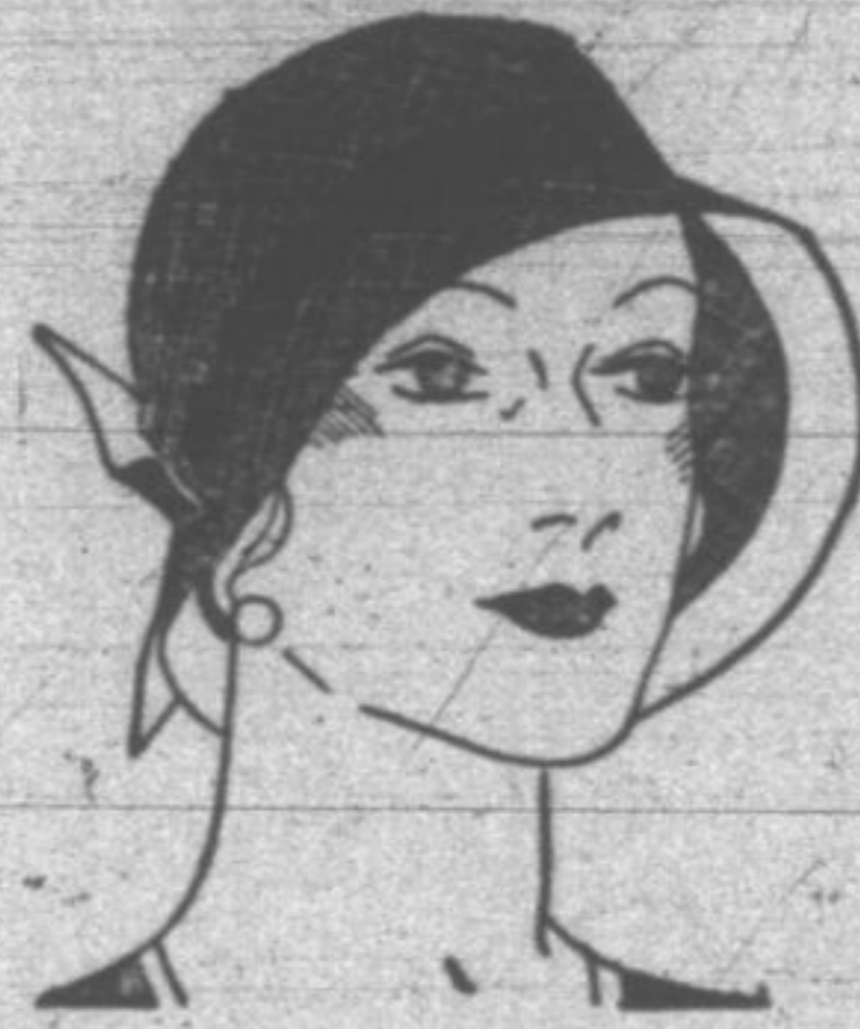
Matron's Hat a youthful brimmed hat of split peanut with taffeta trim, $5.00.